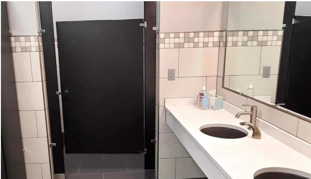
Trucore fitness open now