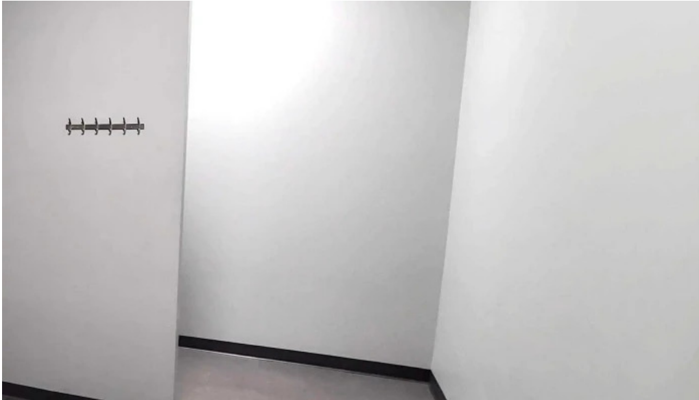
Trucore fitness reviews