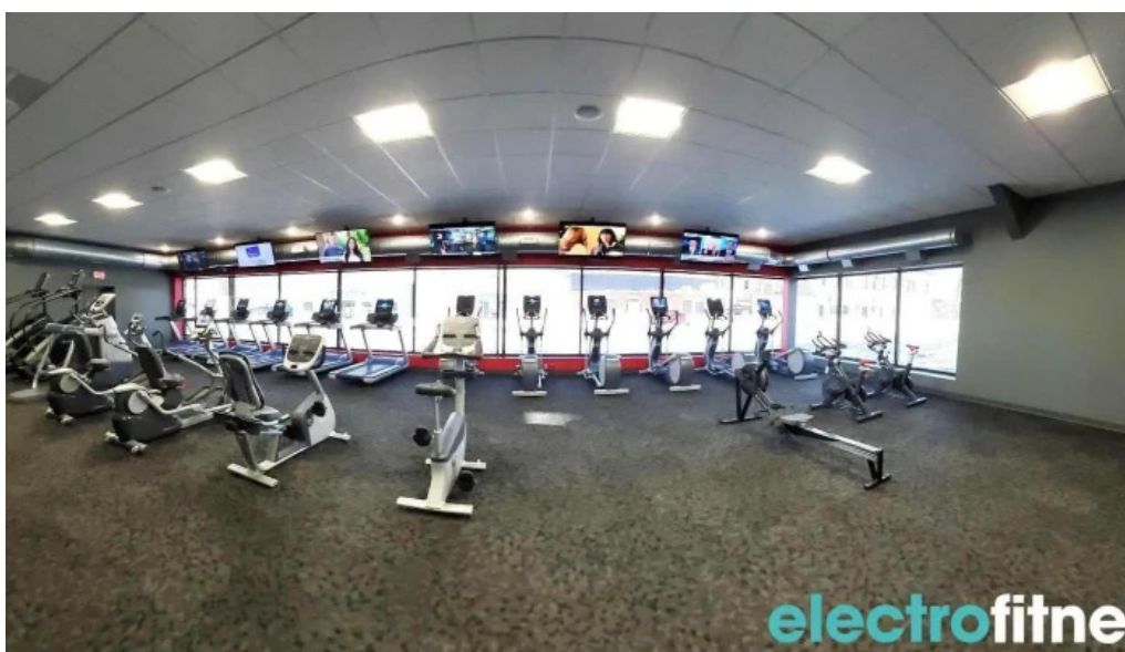
Trucore fitness all