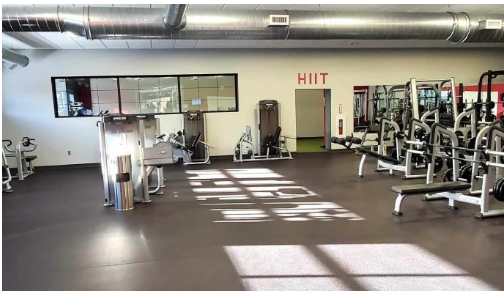
Trucore fitness casselton