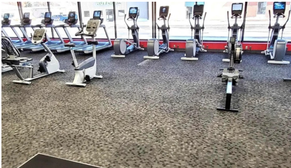
Trucore fitness gym