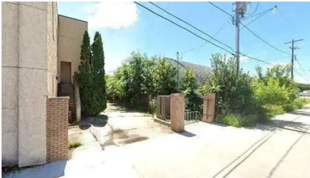
Trucore fitness street view 360deg