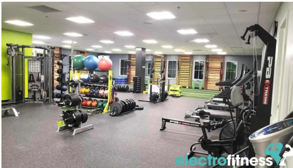
Clarksburg strength fitness clarksburg