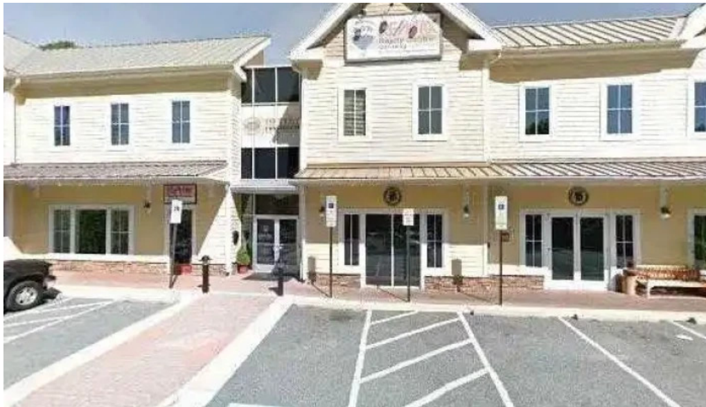
Clarksburg strength fitness street view 360deg