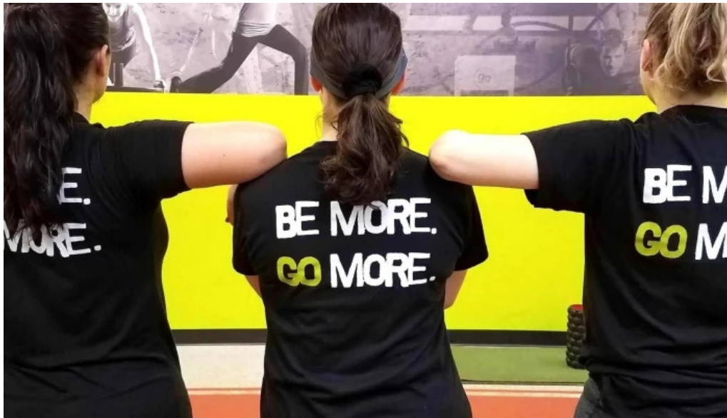
Clarksburg strength fitness gym