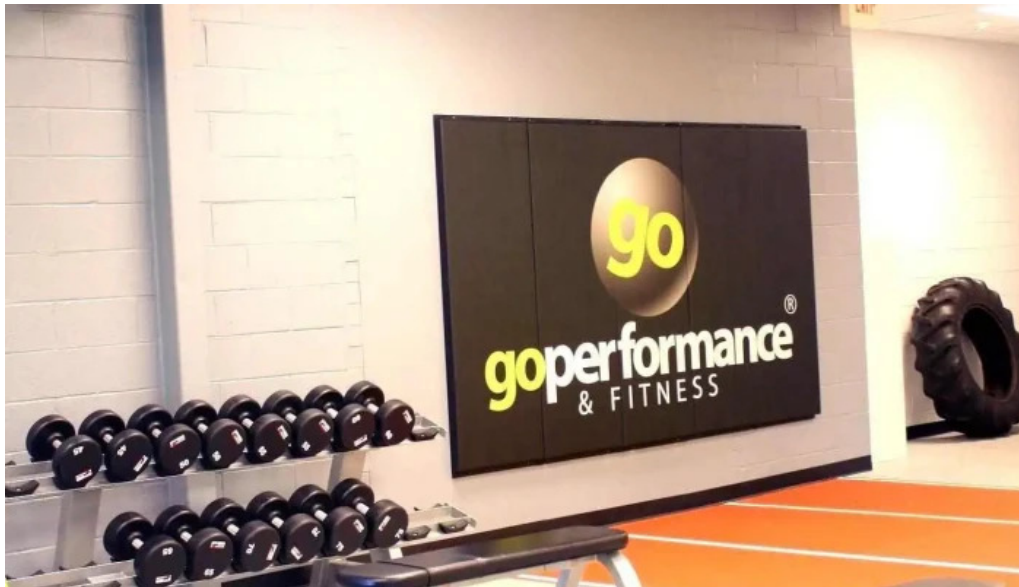
Clarksburg strength fitness by owner