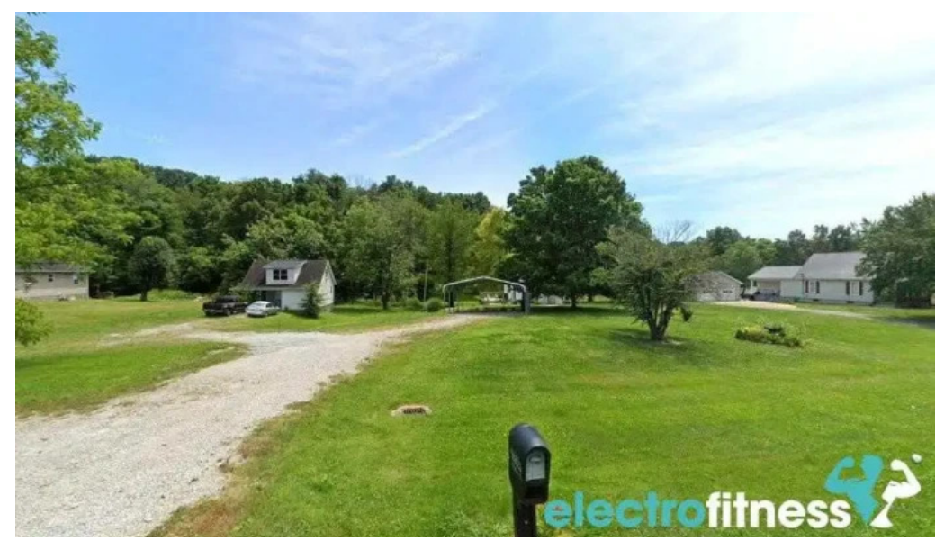
G2r project training and fitness center columbia