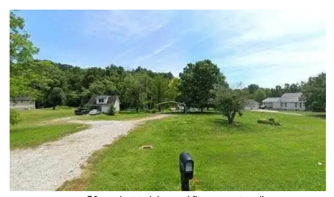
G2r project training and fitness center all