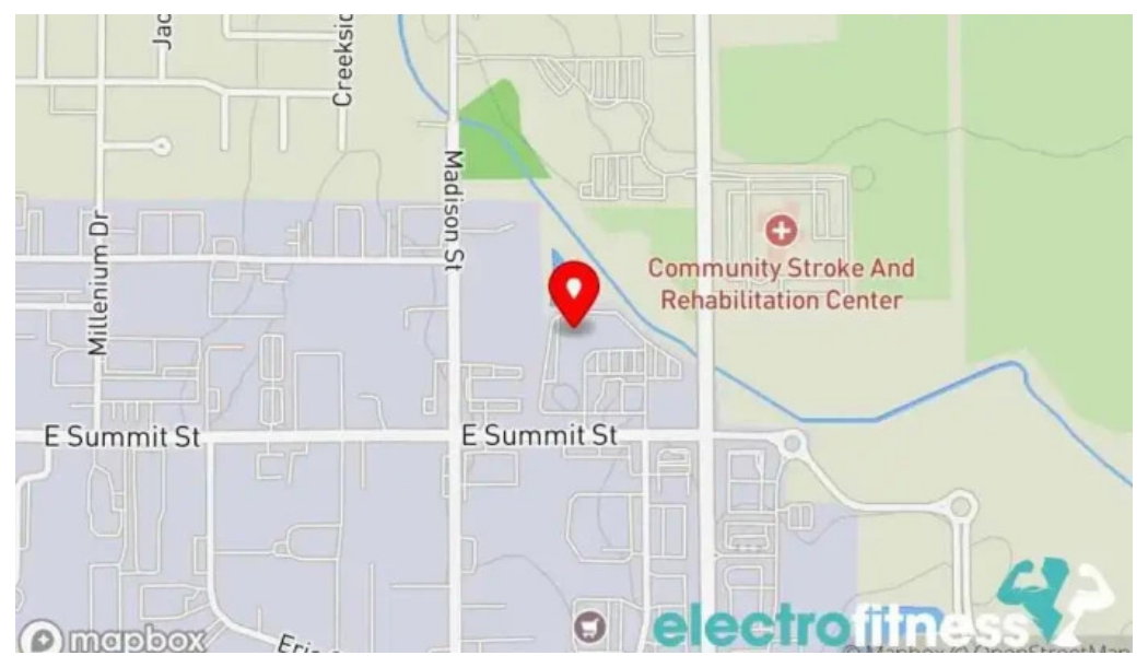
Planet fitness map