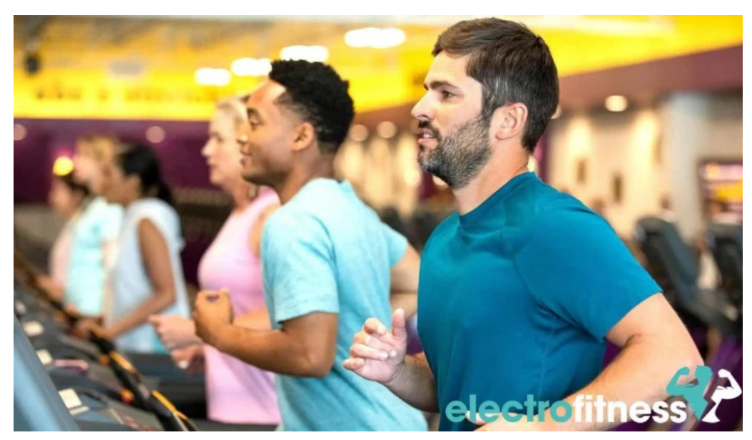
Planet fitness all