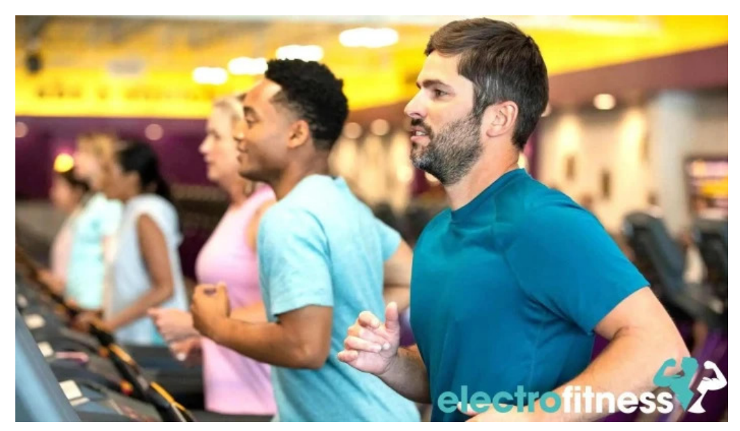
Planet fitness crown point