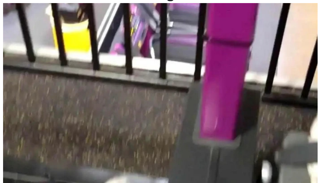
Planet fitness videos