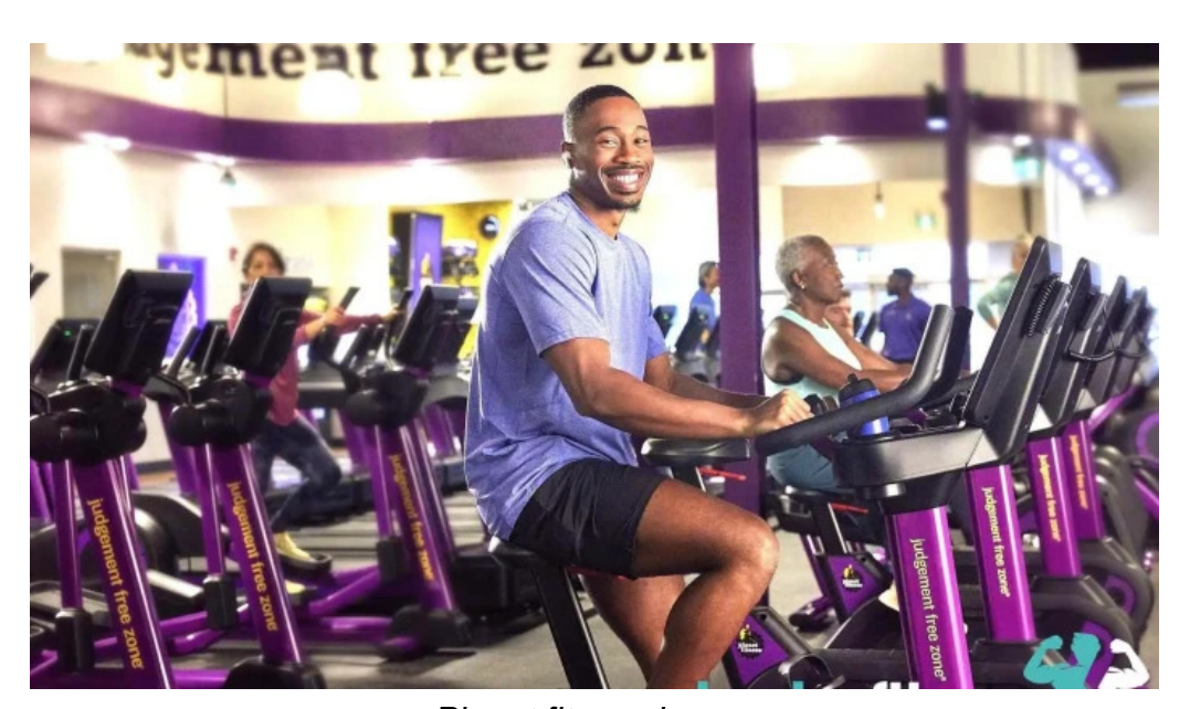
Planet fitness by owner