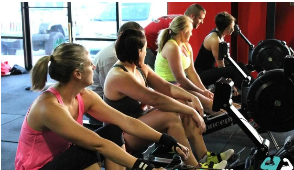
Crossfit allatoona by owner