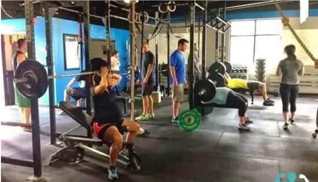
Crossfit allatoona dallas