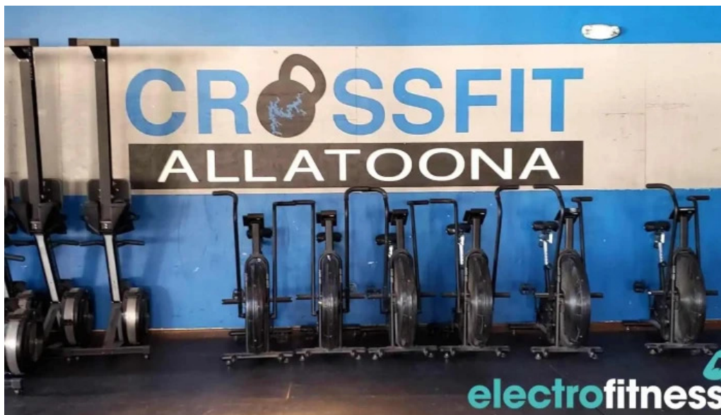
Crossfit allatoona gym