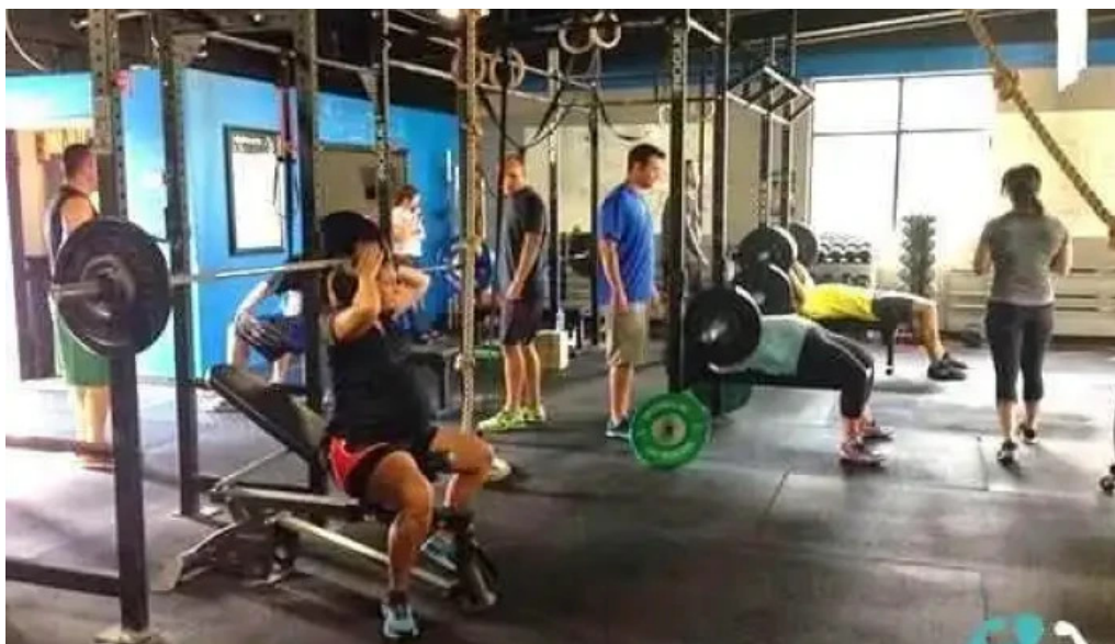
Crossfit allatoona all