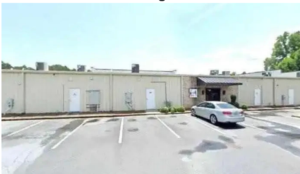
Crossfit allatoona street view 360deg