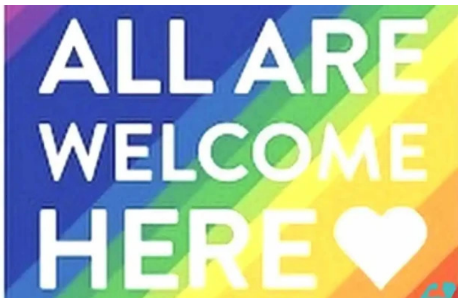
Colorado fitness strength by owner