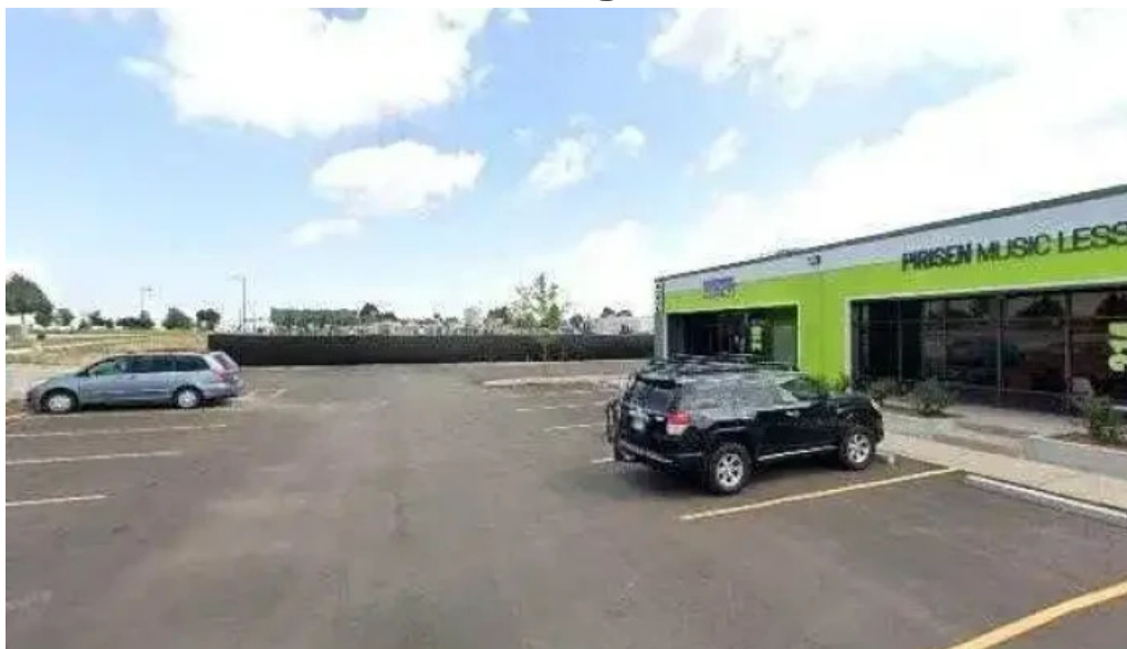
Colorado fitness strength street view 360deg