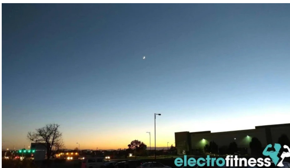
Colorado fitness strength all