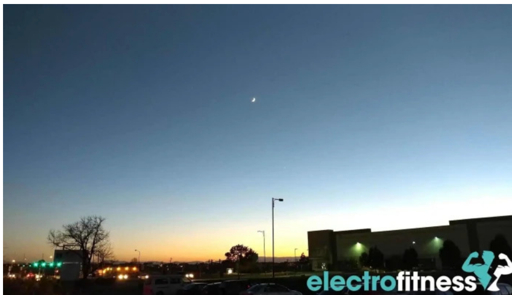
Colorado fitness strength denver