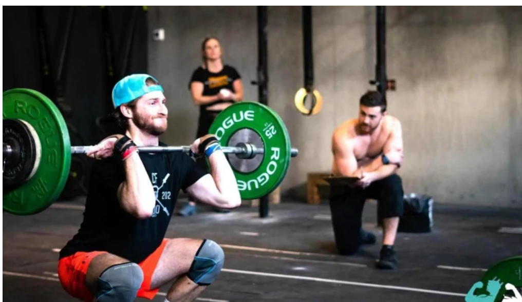
Crossfit lodo all