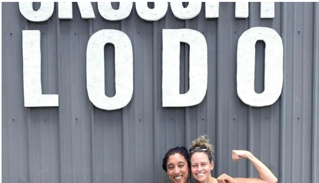
Crossfit lodo denver