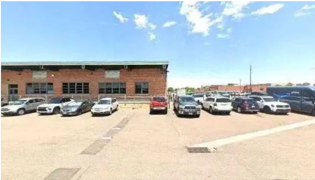
Crossfit Iodo street view 360deg