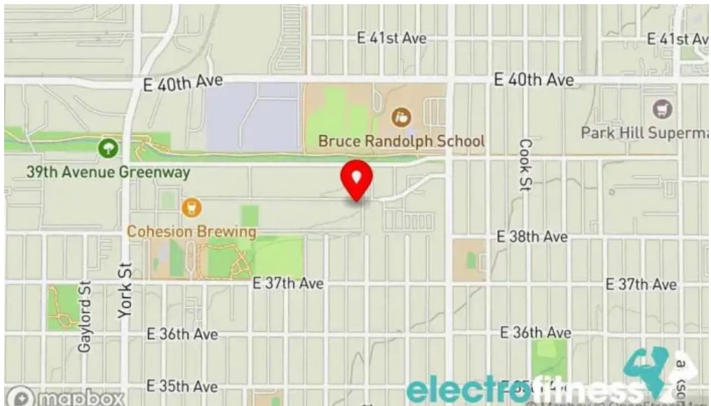
Crossfit Iodo map