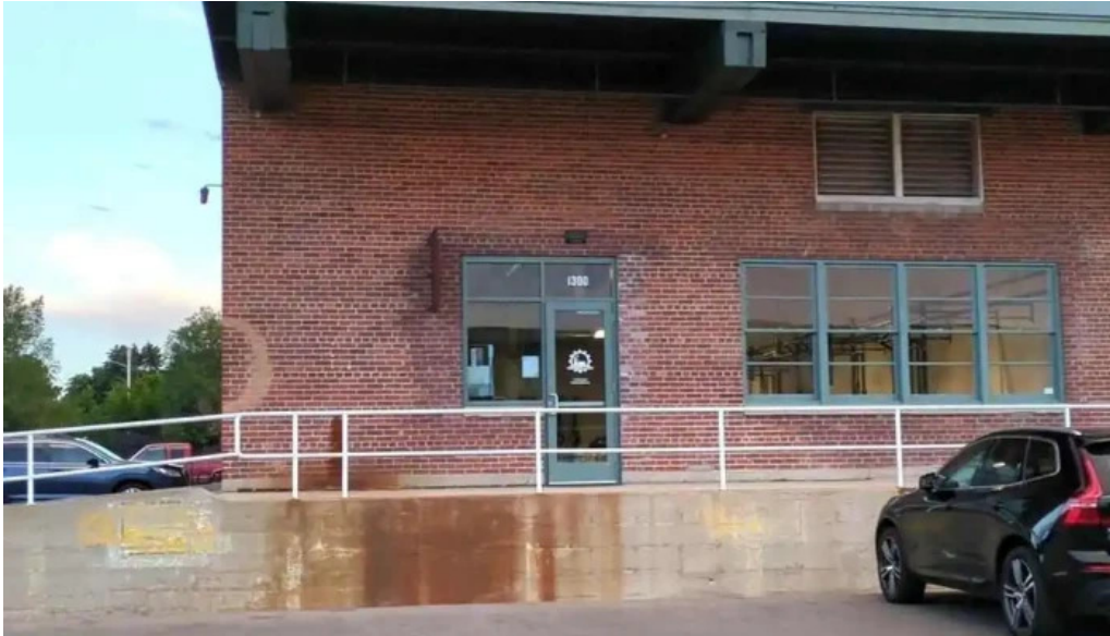
Crossfit Iodo videos