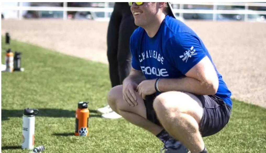
Crossfit lodo