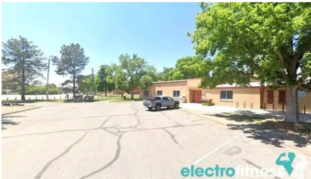
Fitness trail denver