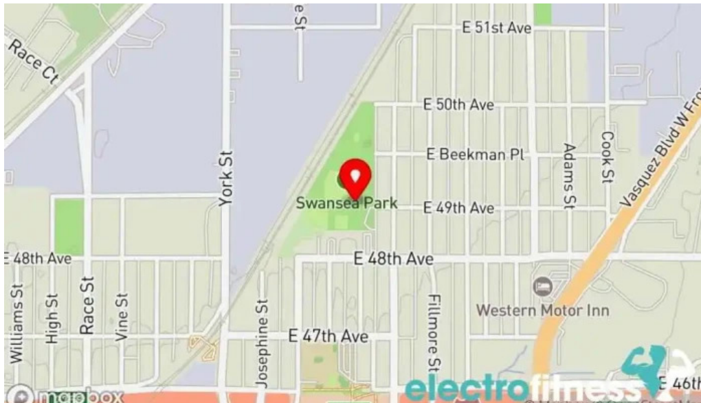
Fitness trail map