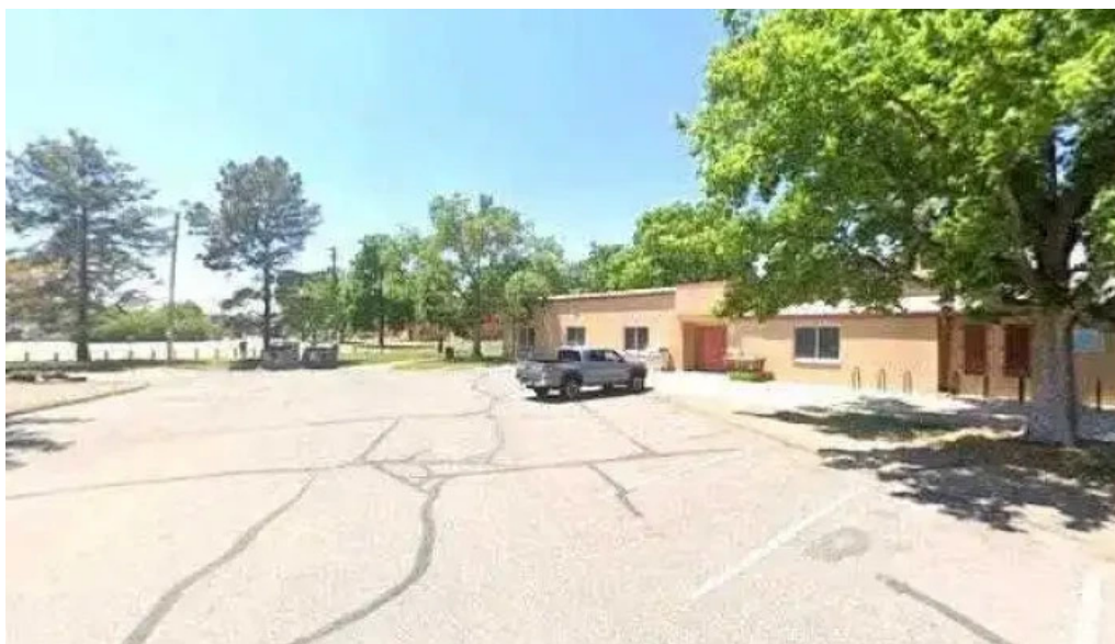
Fitness trail all