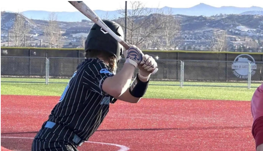
Primal performance gym