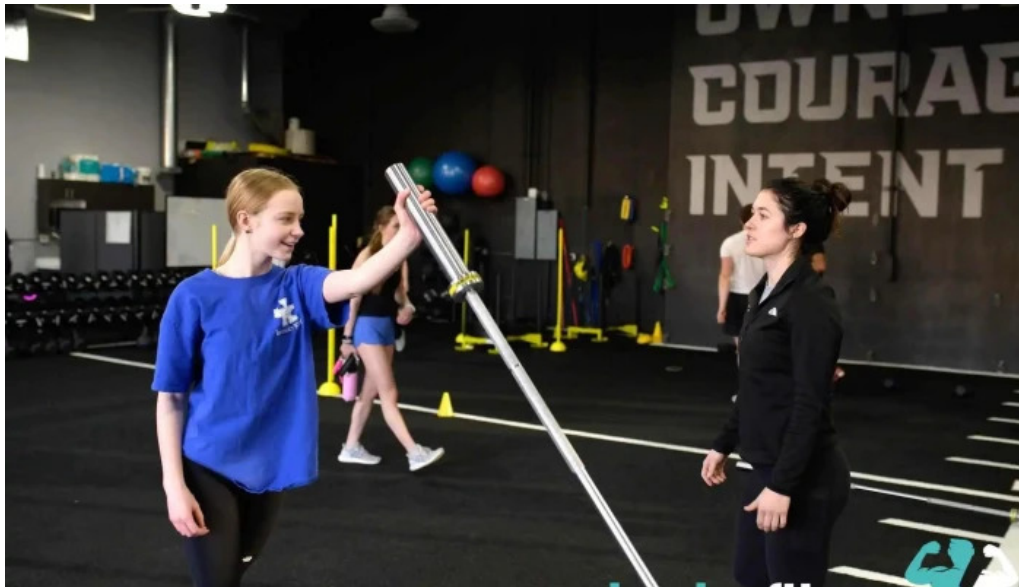
Primal performance by owner