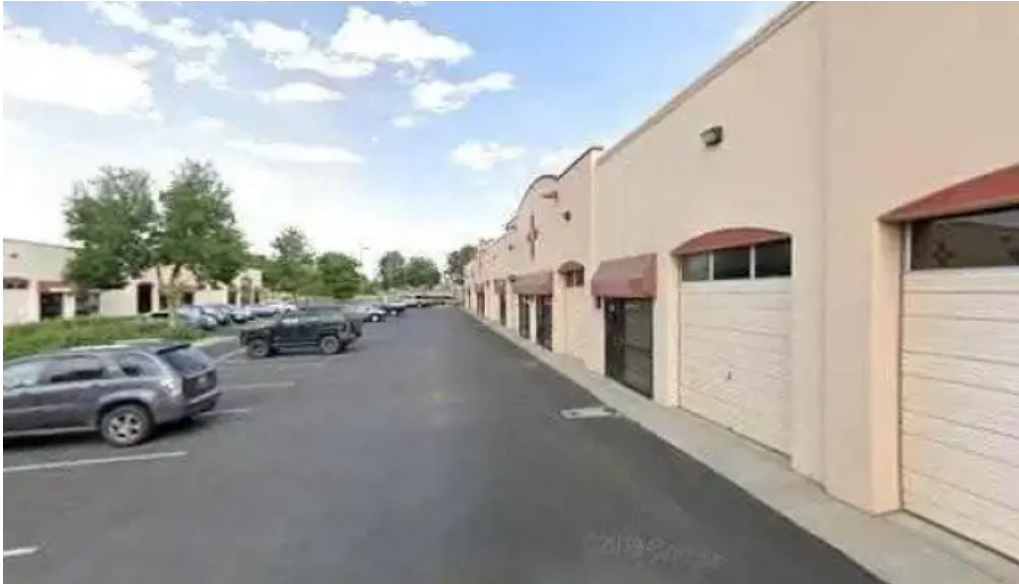
Primal performance street view 360deg