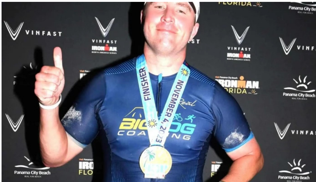
Primal performance near me