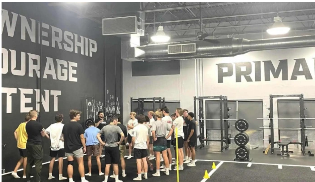
Primal performance open now