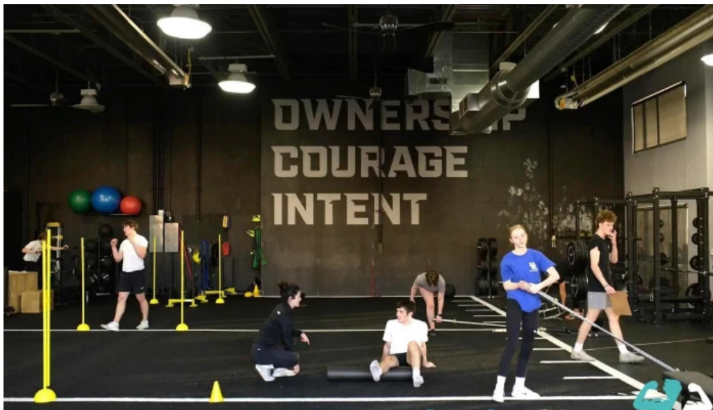
Primal performance all