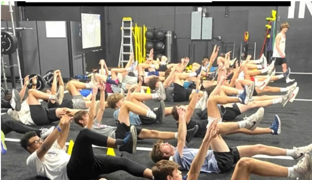
Primal performance denver