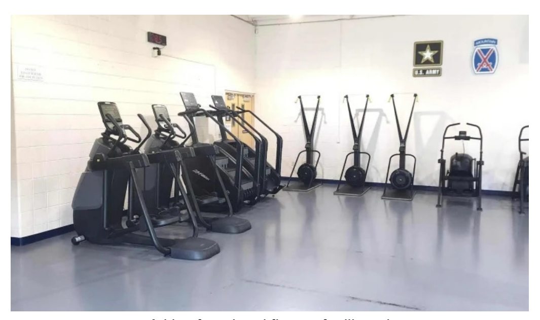
Atkins functional fitness facility prices