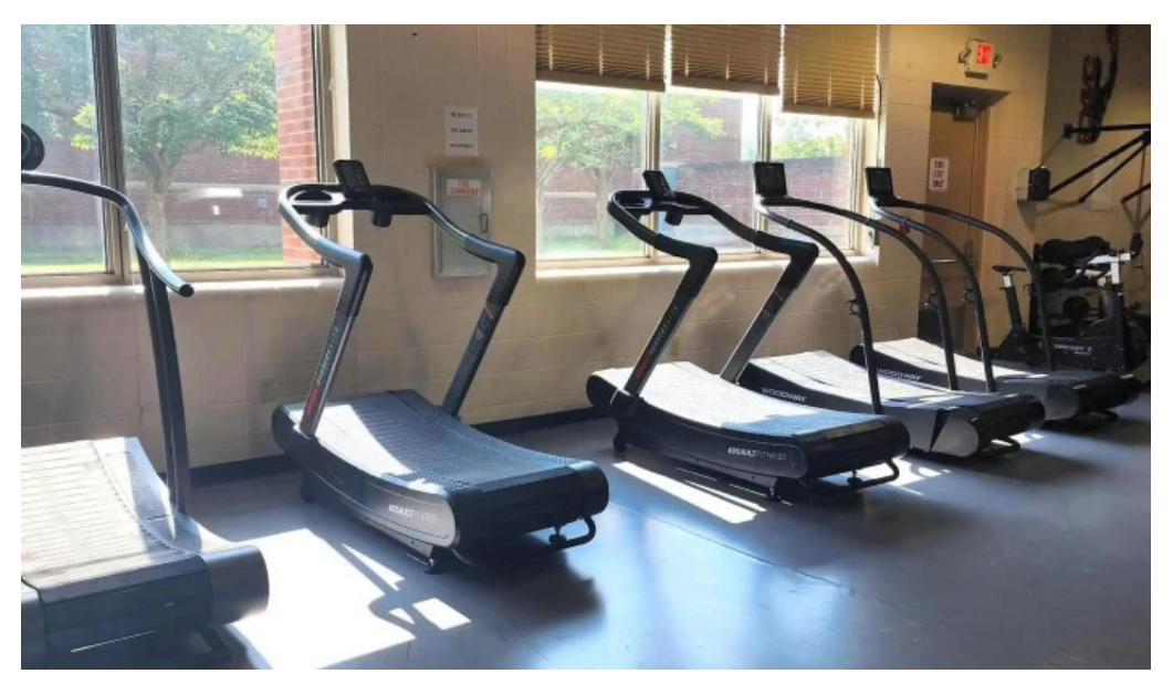
Atkins functional fitness facility open now