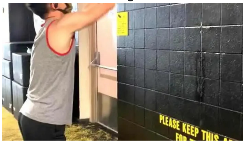
Atkins functional fitness facility videos