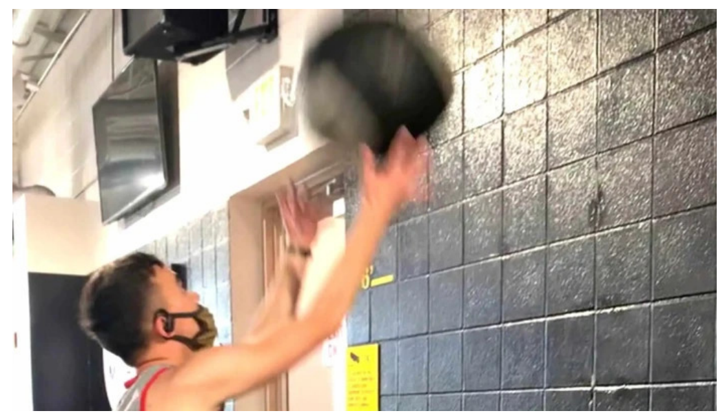
Atkins functional fitness facility schedule