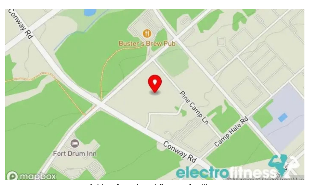
Atkins functional fitness facility map