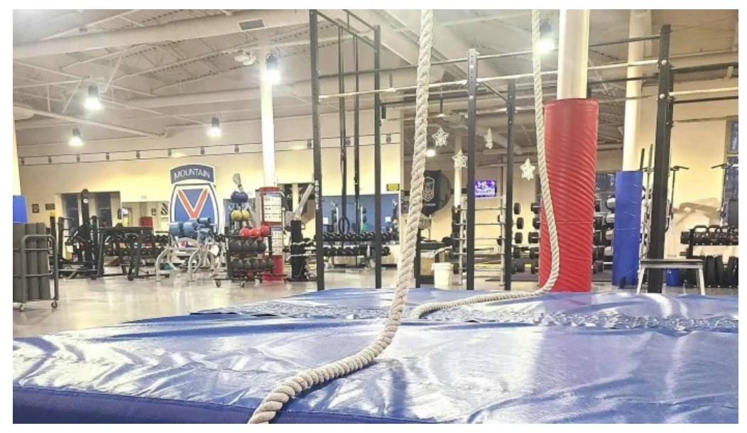
Atkins functional fitness facility fort drum