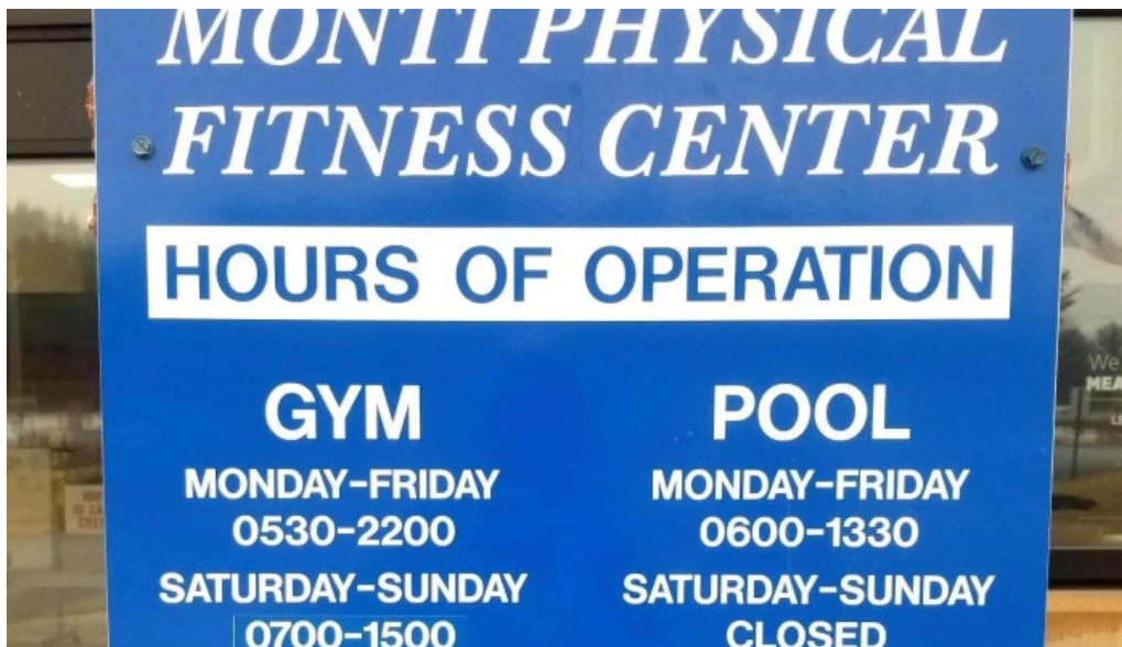
Jared c monti physical fitness center fort drum