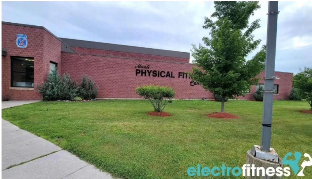
Jared c monti physical fitness center all