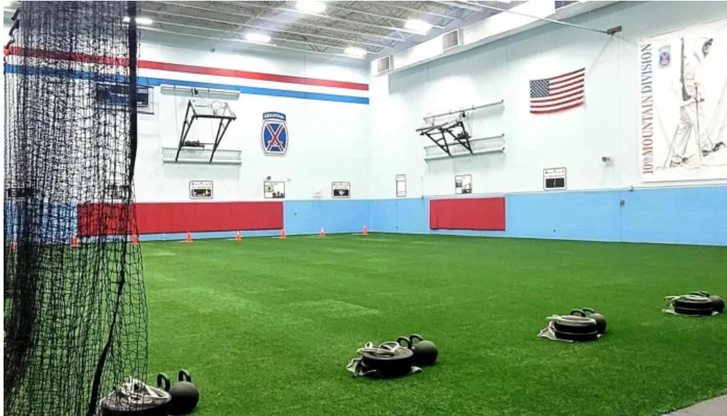
Jared c monti physical fitness center gym