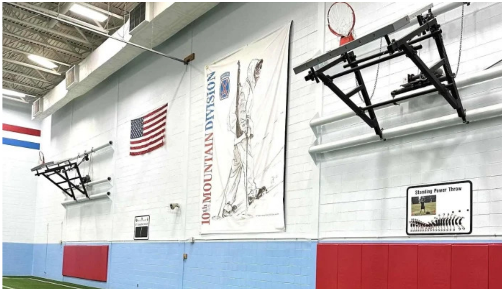
Jared c monti physical fitness center open now