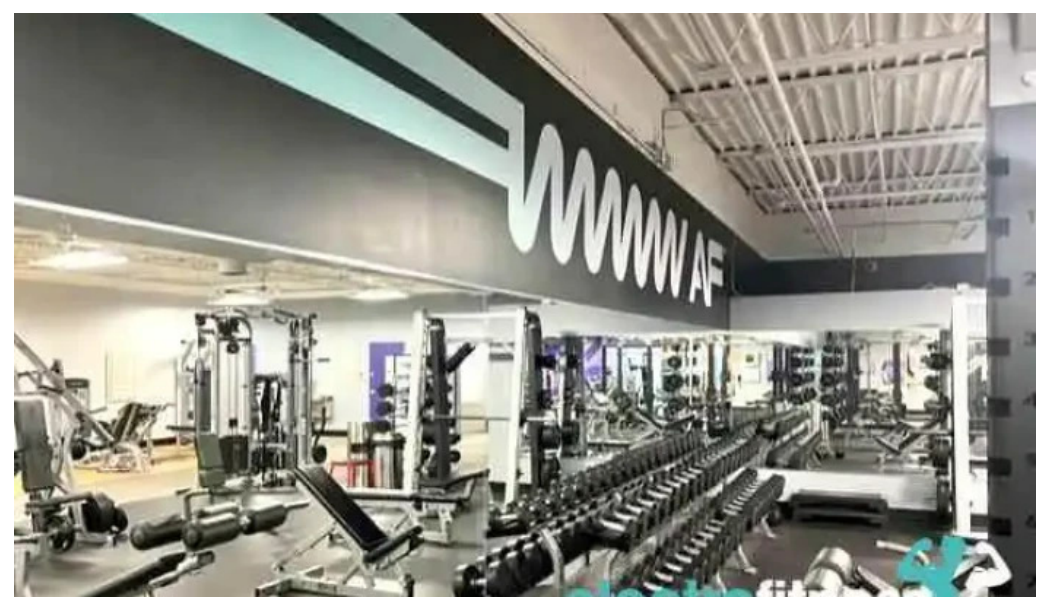
Anytime fitness fort wayne