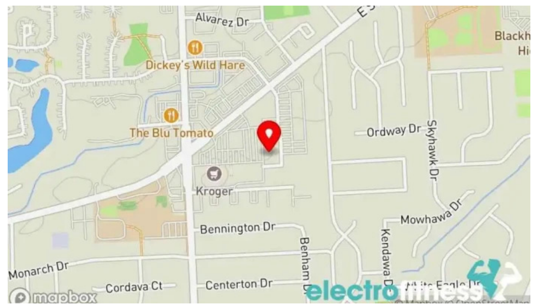
Anytime fitness map