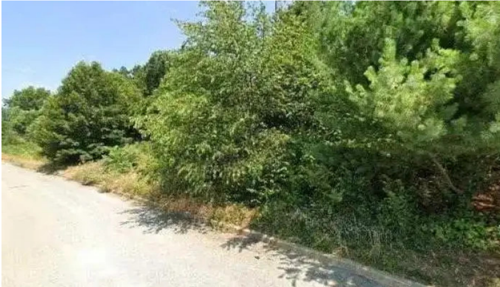
Peak performance and fitness center street view 360deg