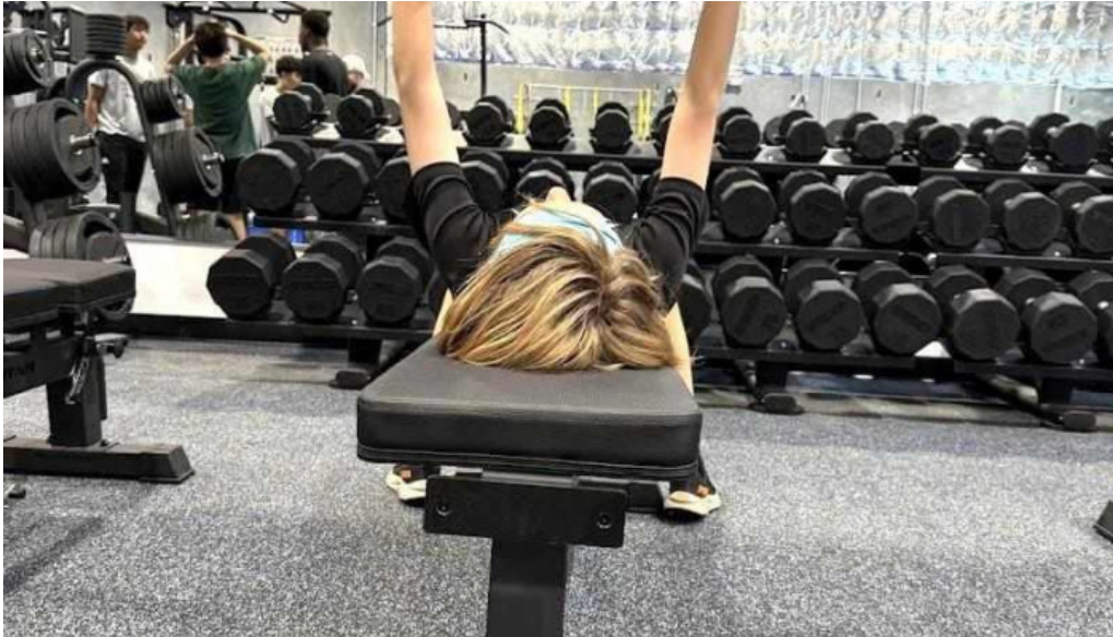
Peak performance and fitness center frederick