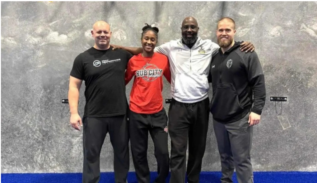
Peak performance and fitness center by owner