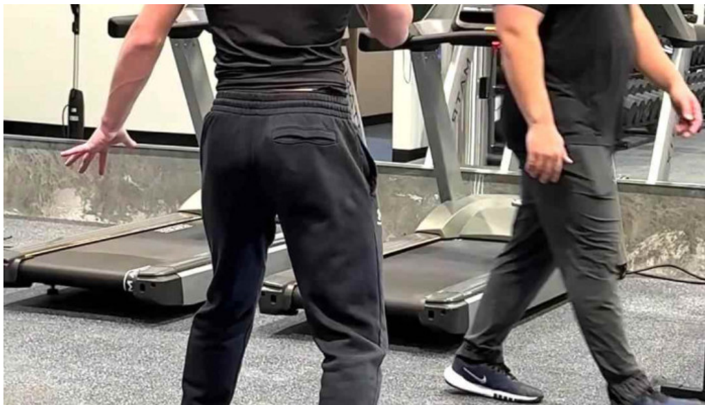
Peak performance and fitness center gym