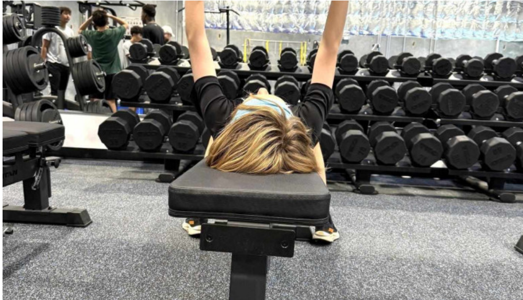
Peak performance and fitness center all