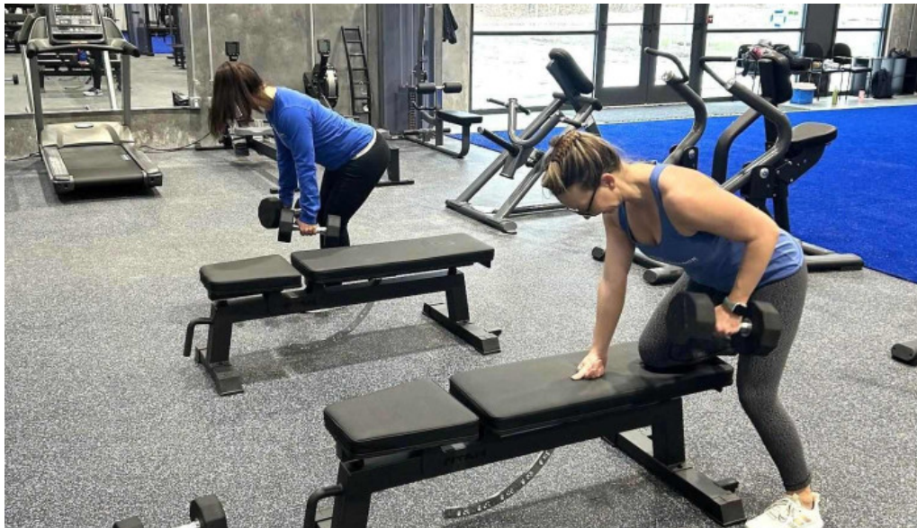
Peak performance and fitness center latest