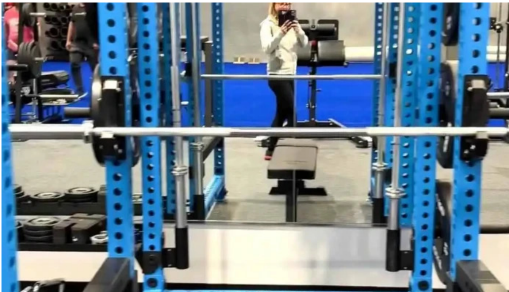
Peak performance and fitness center videos