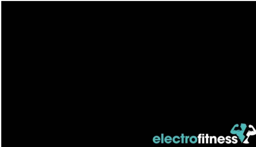
Players fitness and performance videos