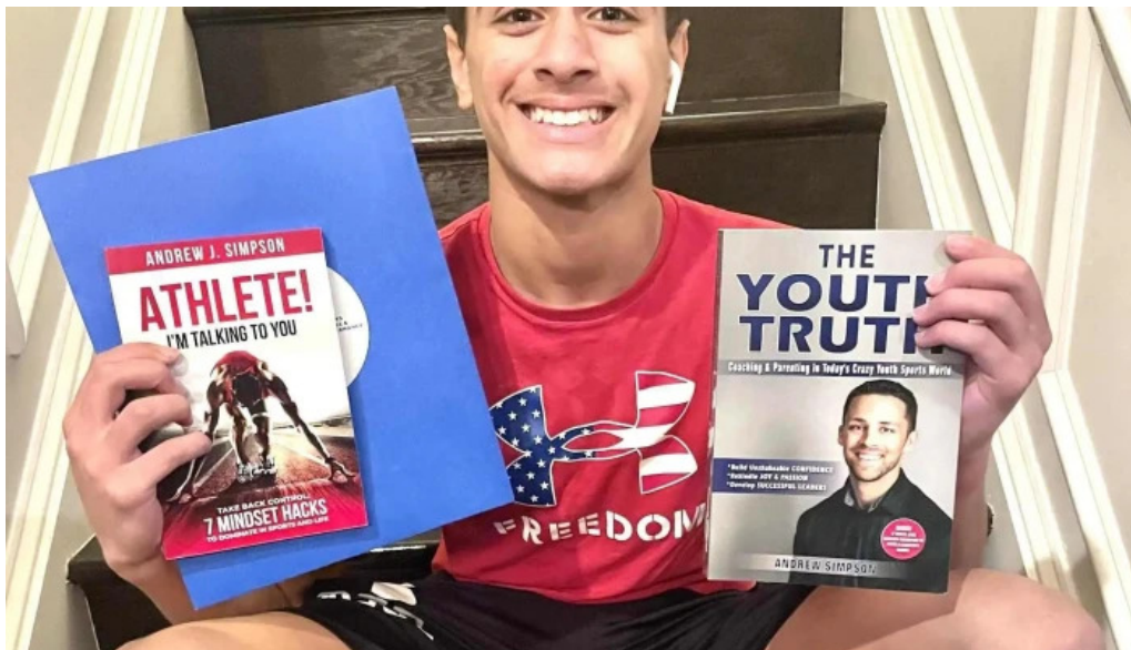
Players fitness and performance promotion