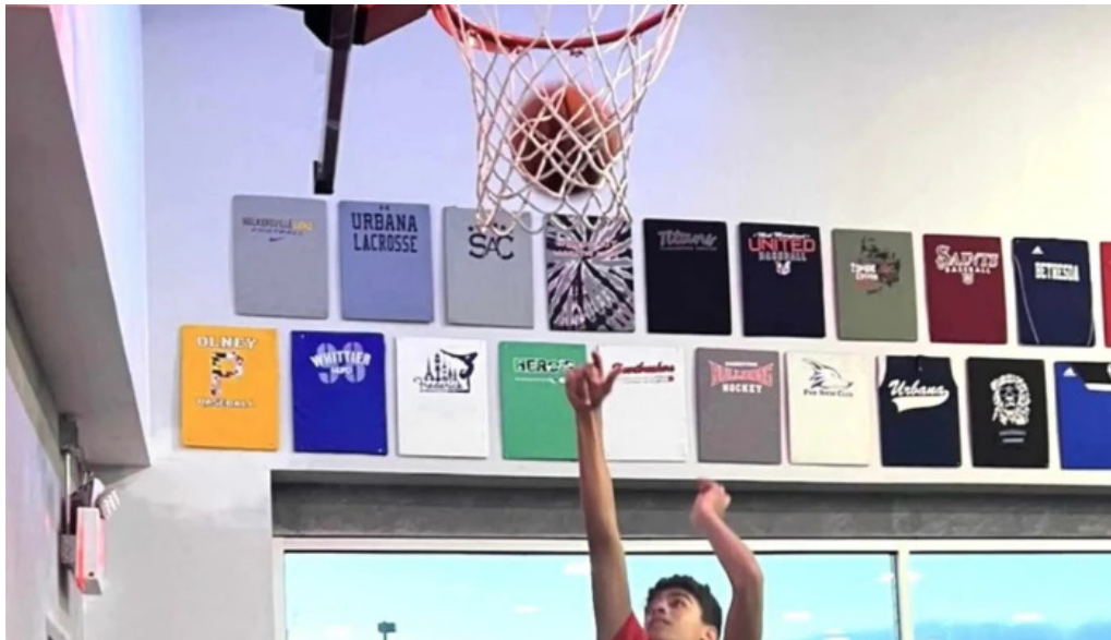
Players fitness and performance score