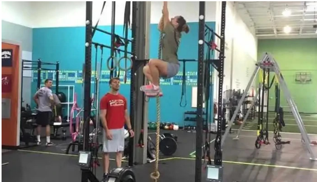
Players fitness and performance by owner