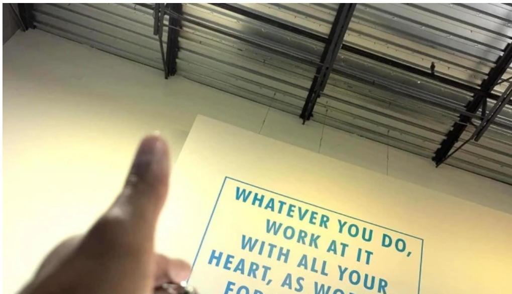
Players fitness and performance frederick