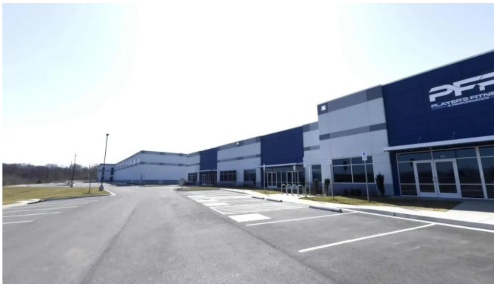
Players fitness and performance street view 360deg