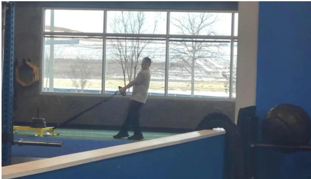
Players fitness and performance gym