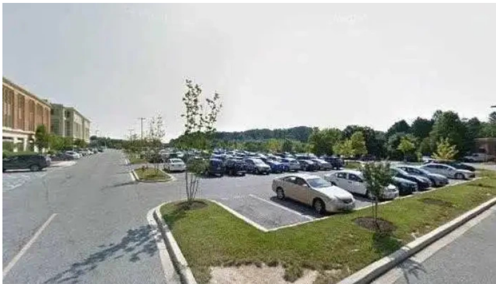
Fitness street view 360deg