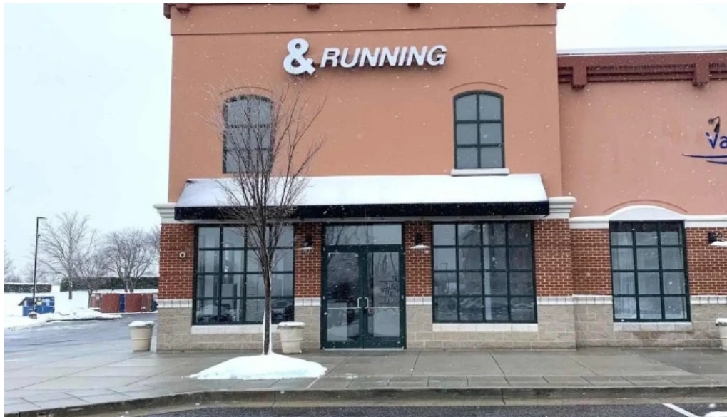
Fitness by owner