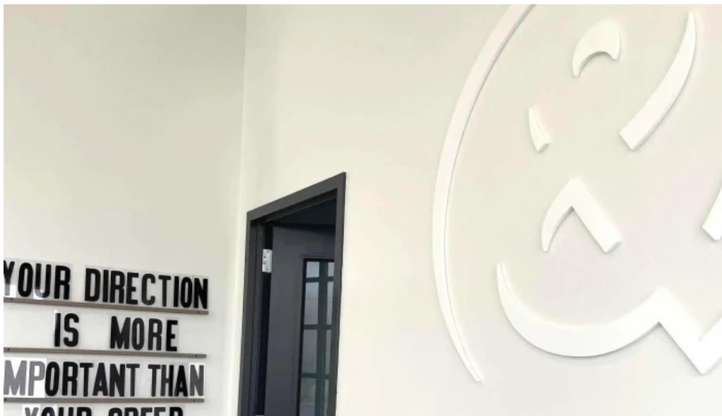
Fitness near me