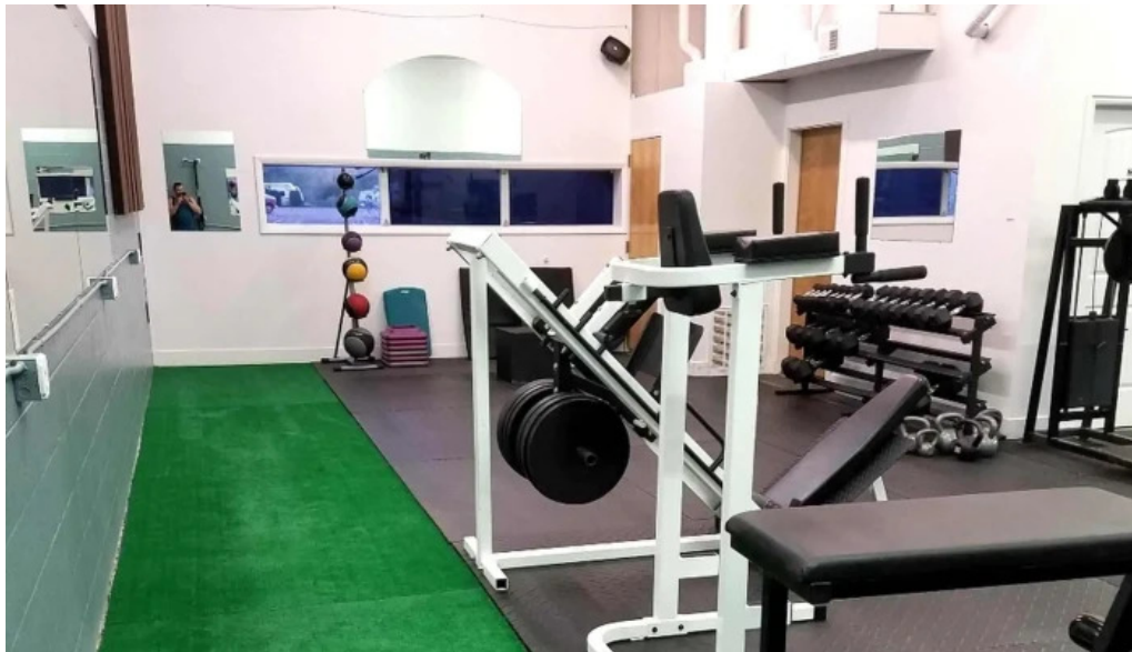
Shanes fitness gym