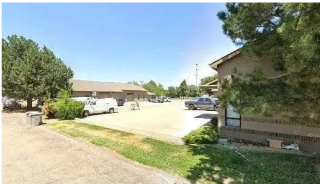
Shanes fitness street view 360deg