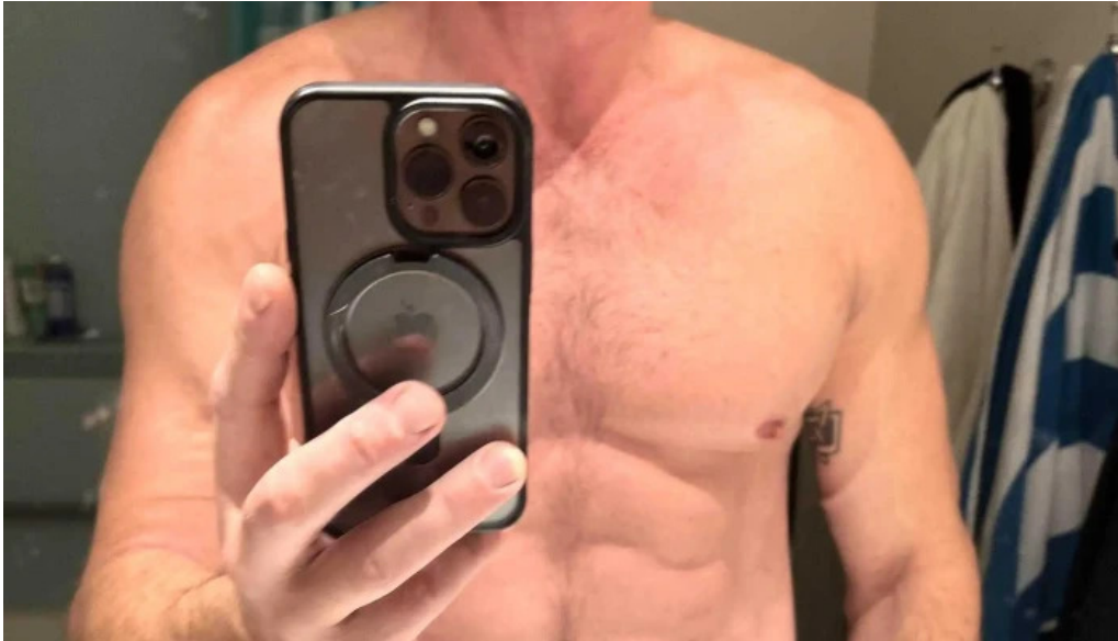
Shanes fitness open now