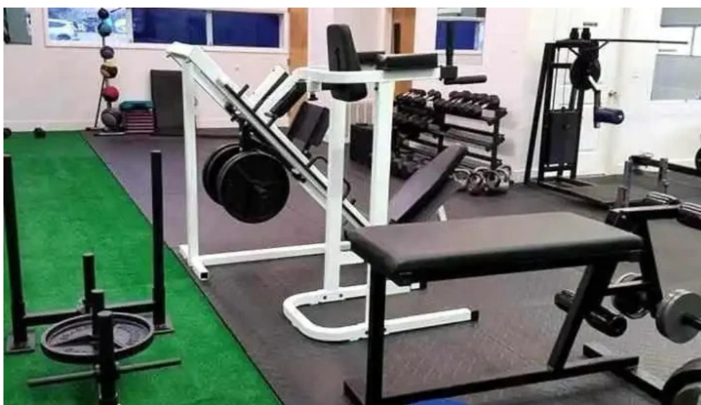
Shane s fitness garden city