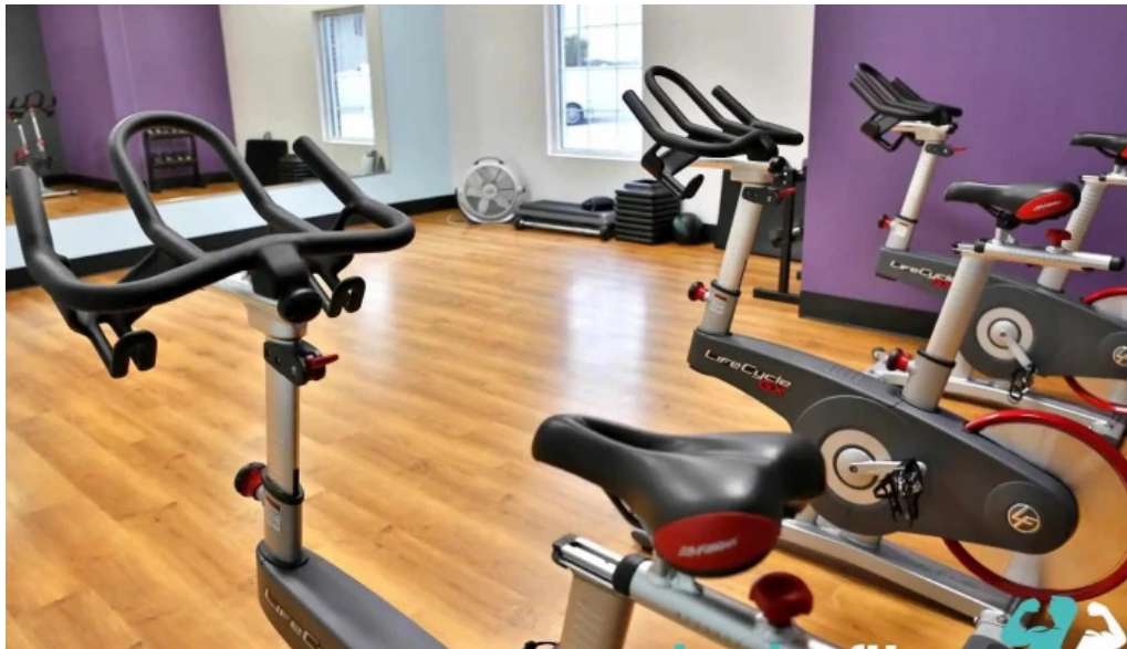
Anytime fitness exercise machine