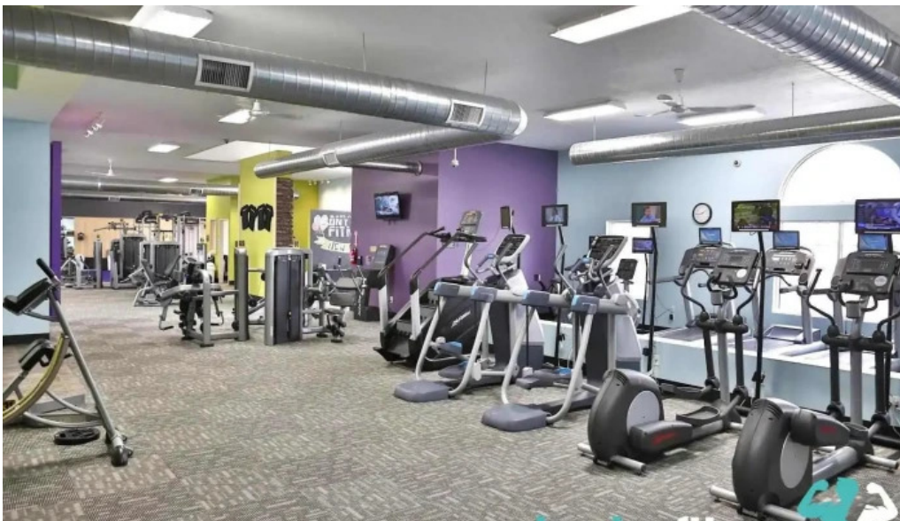
Anytime fitness grand island