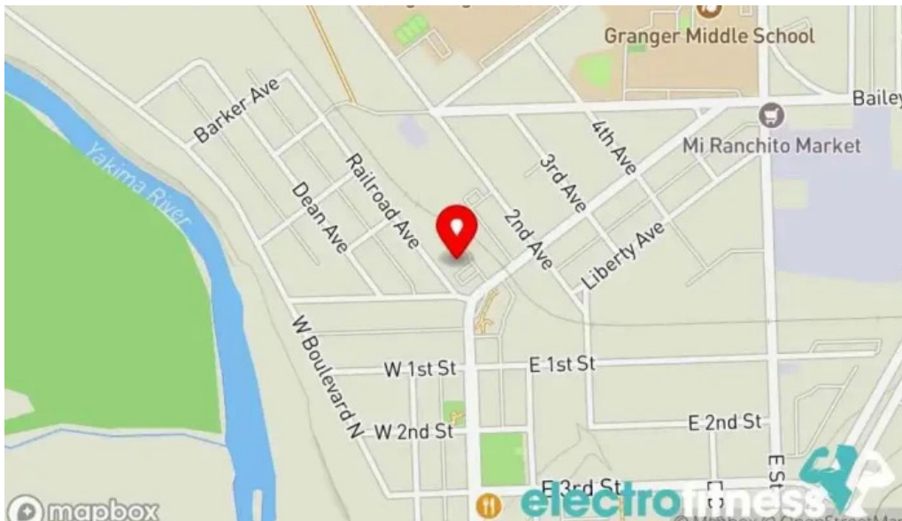
Anytime fitness map