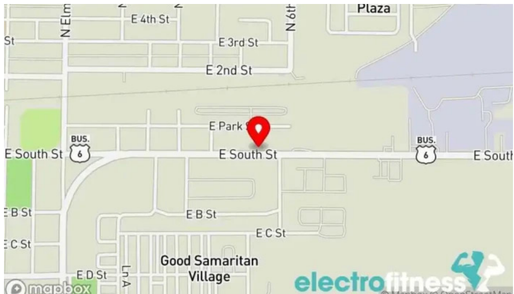
Anytime fitness map