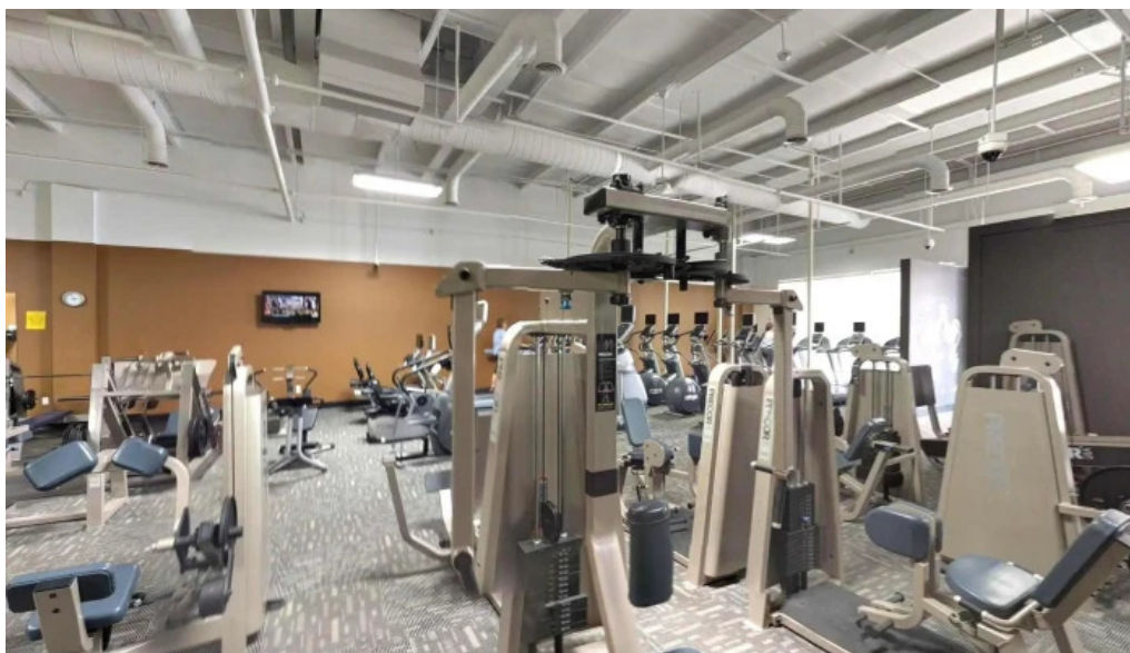
Anytime fitness all