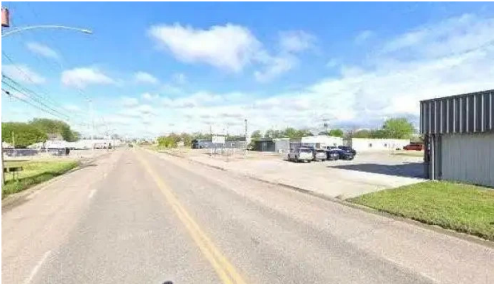
Anytime fitness street view 360deg