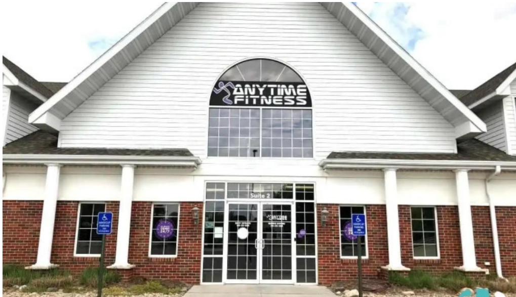
Anytime fitness kearney