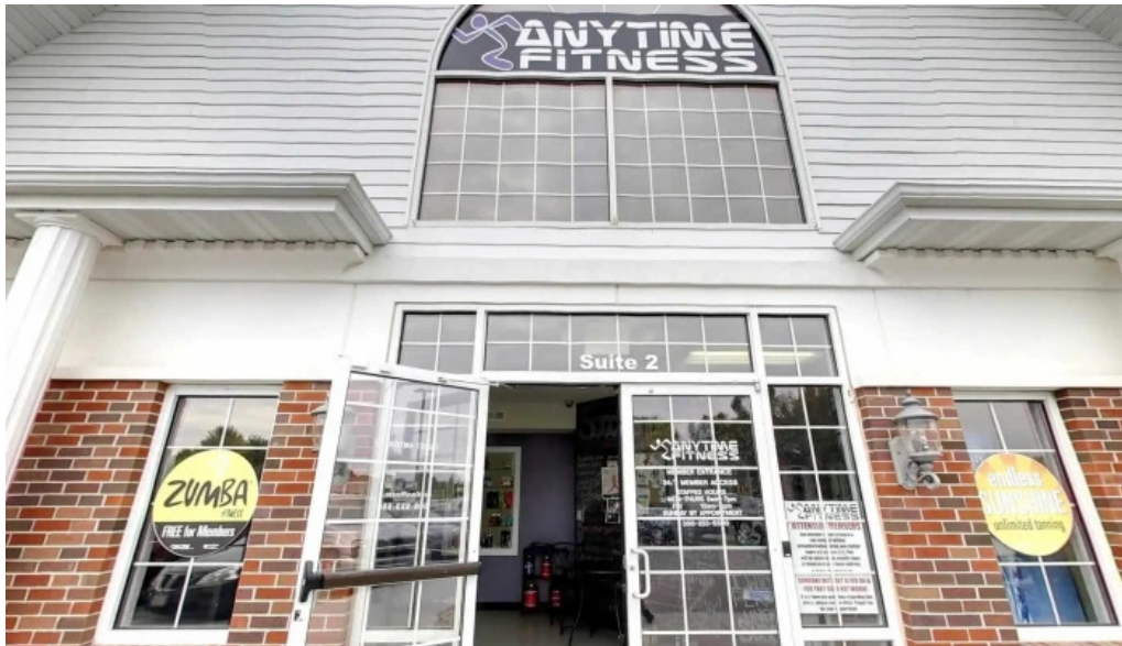
Anytime fitness street view 360deg