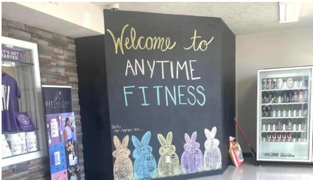
Anytime fitness gym