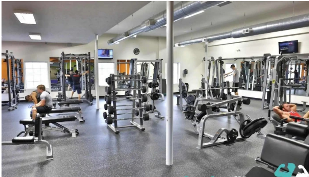
Anytime fitness exercise machine