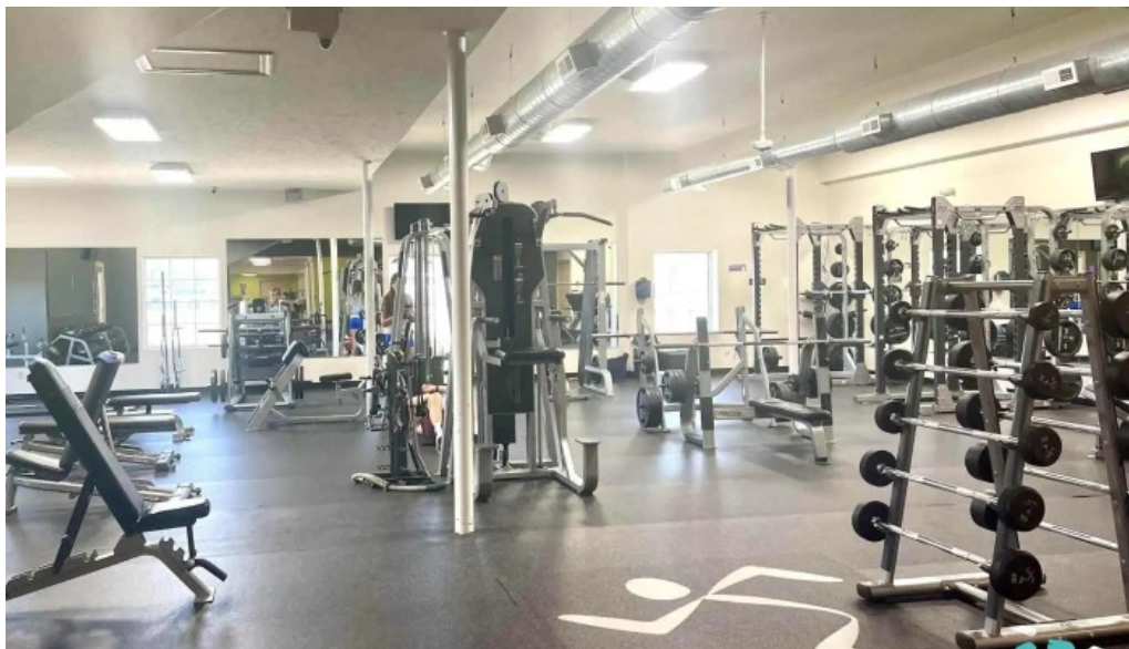
Anytime fitness by owner