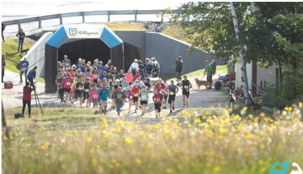
Killington boot camp by owner