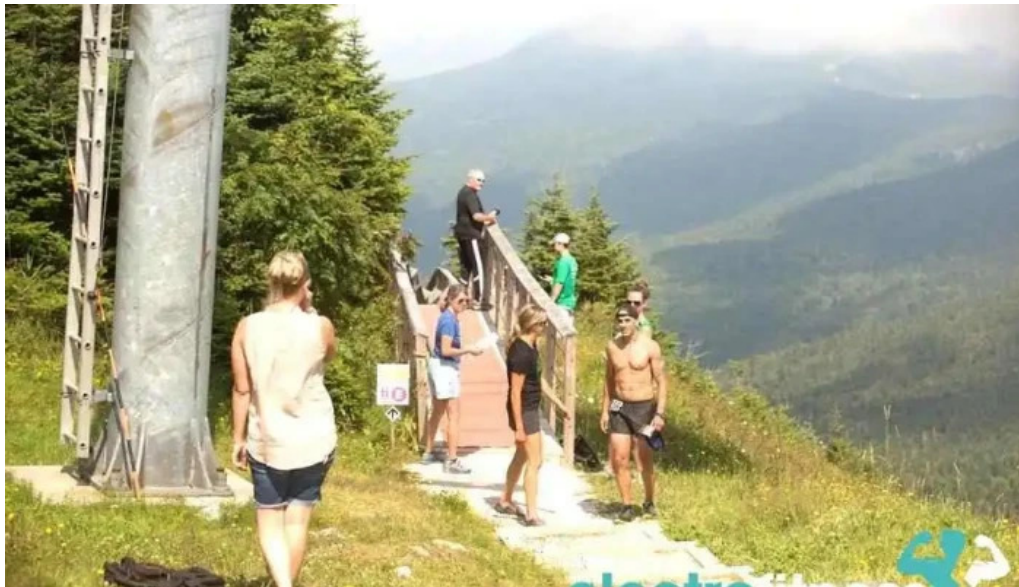
Killington boot camp all