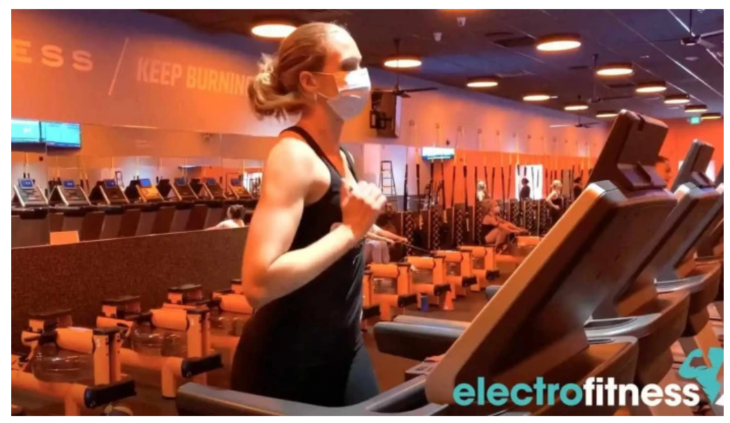
Orangetheory fitness exercise machine