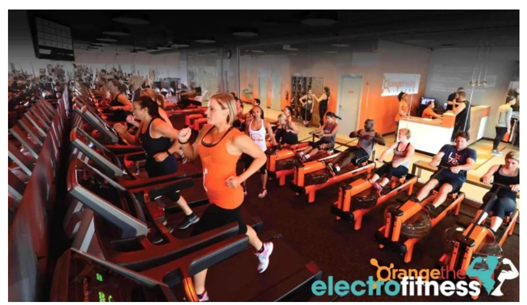
Orangetheory fitness all