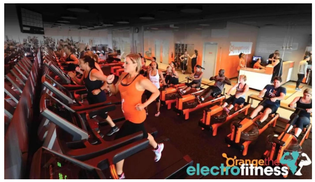
Orangetheory fitness kingston