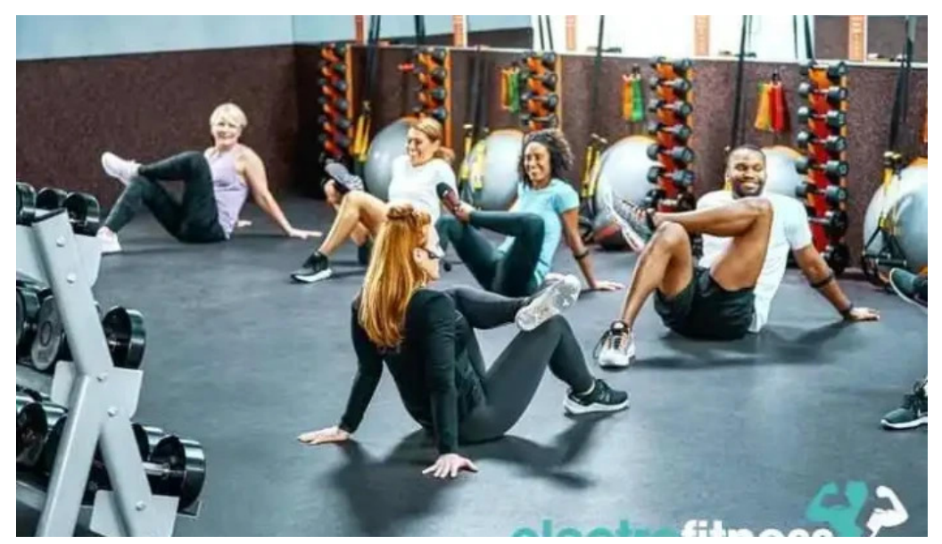
Orangetheory fitness gym