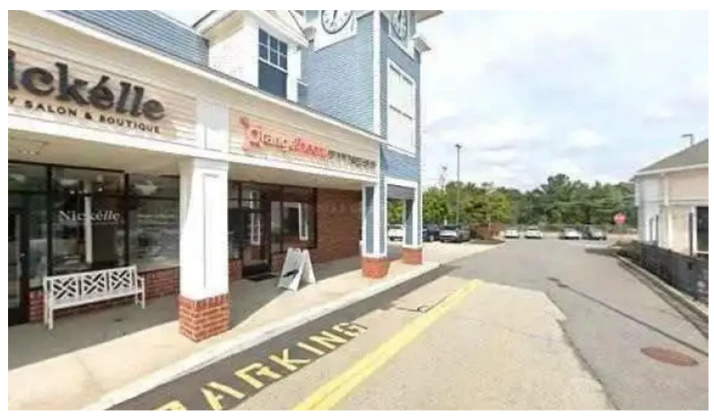
Orangetheory fitness street view 360deg