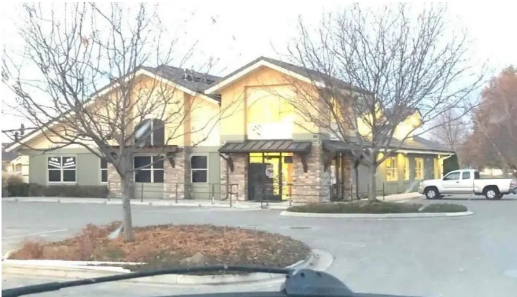
Anytime fitness meridian