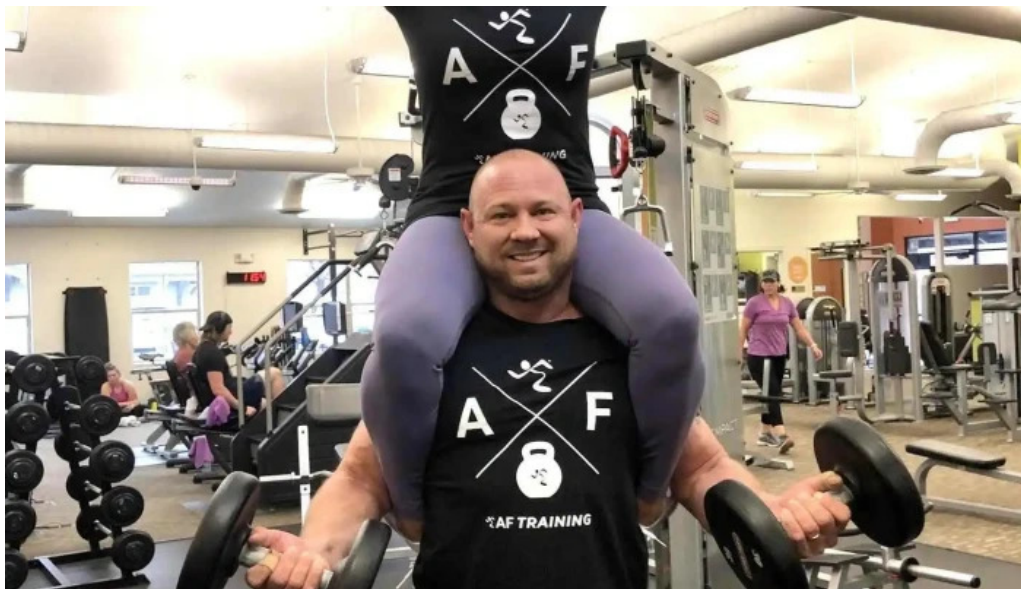
Anytime fitness gym