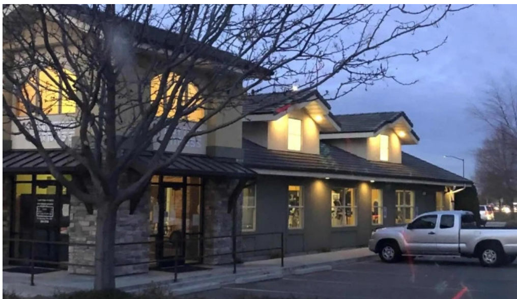
Anytime fitness by owner