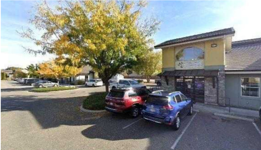
Anytime fitness street view 360deg