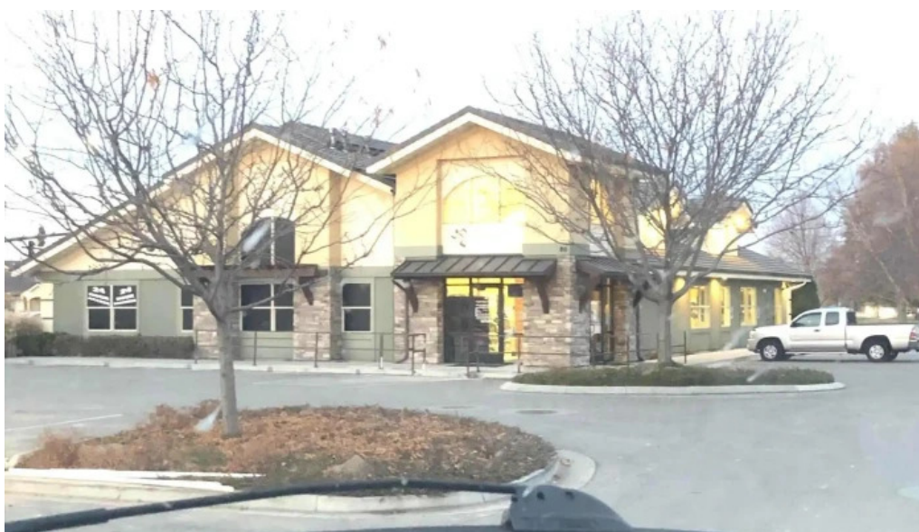
Anytime fitness all