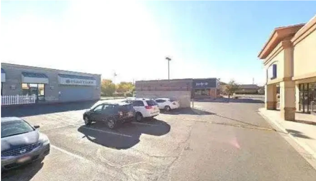
Champion fitness training street view 360deg