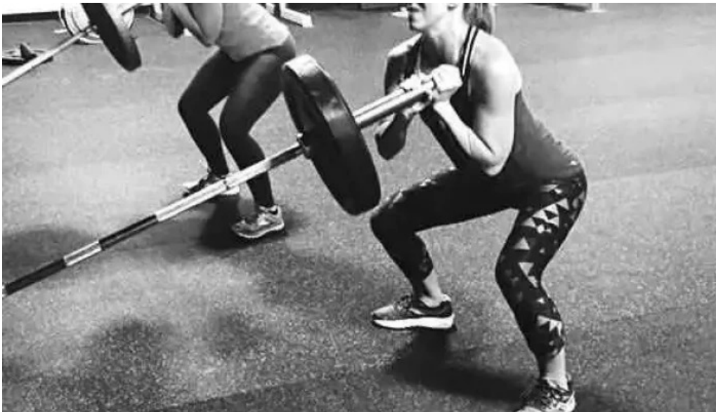
Champion fitness training gym