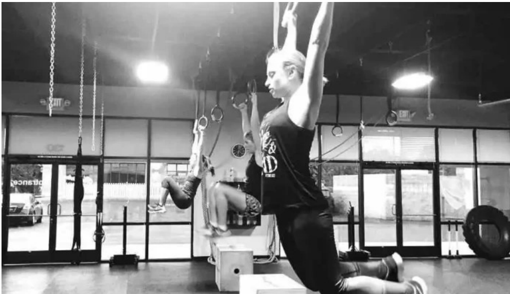
Champion fitness training meridian