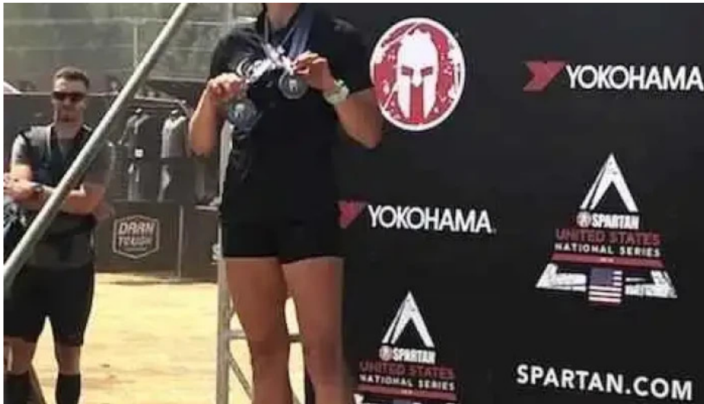
Champion fitness training by owner