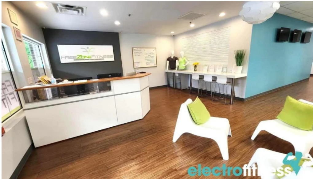
Freezone fitness all