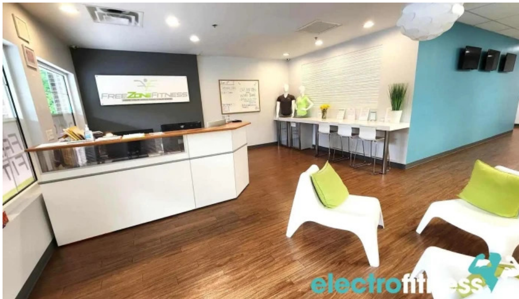
Freezone fitness new market