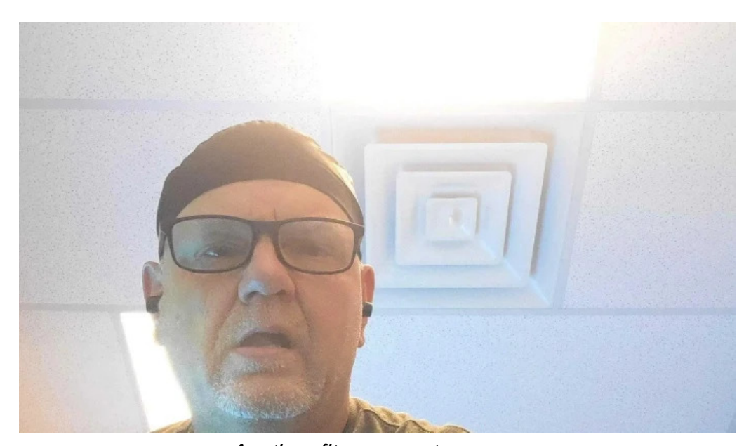
Anytime fitness newton near me