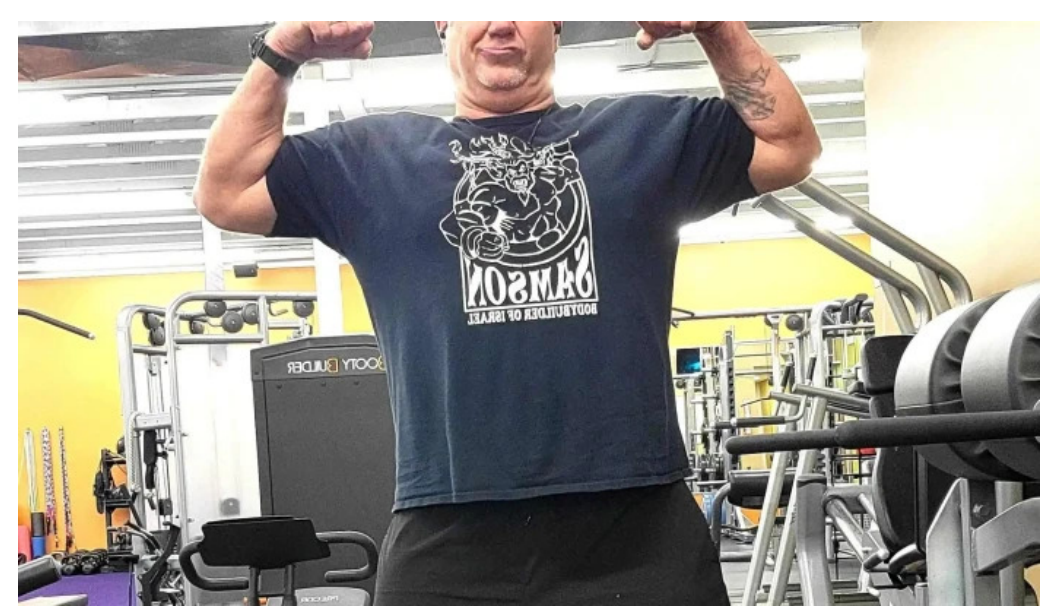
Anytime fitness newton instagram