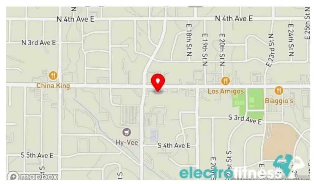
Anytime fitness newton map