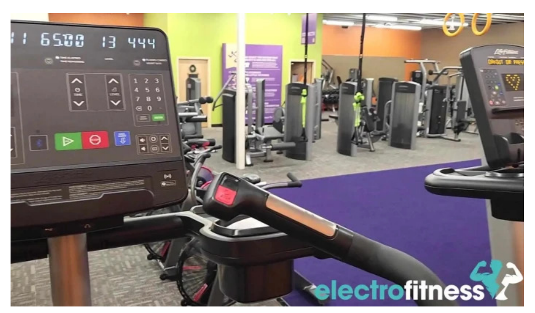
Anytime fitness newton videos