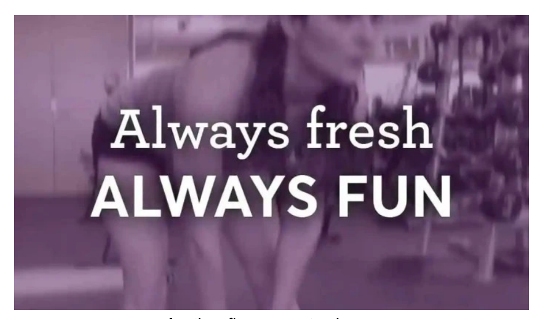
Anytime fitness newton by owner