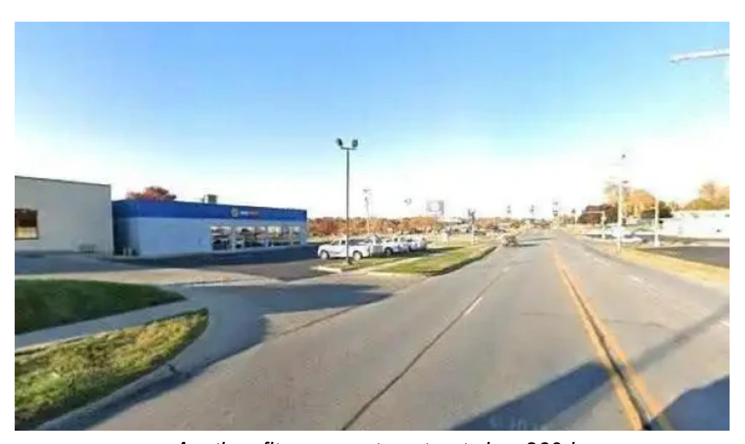
Anytime fitness newton street view 360deg