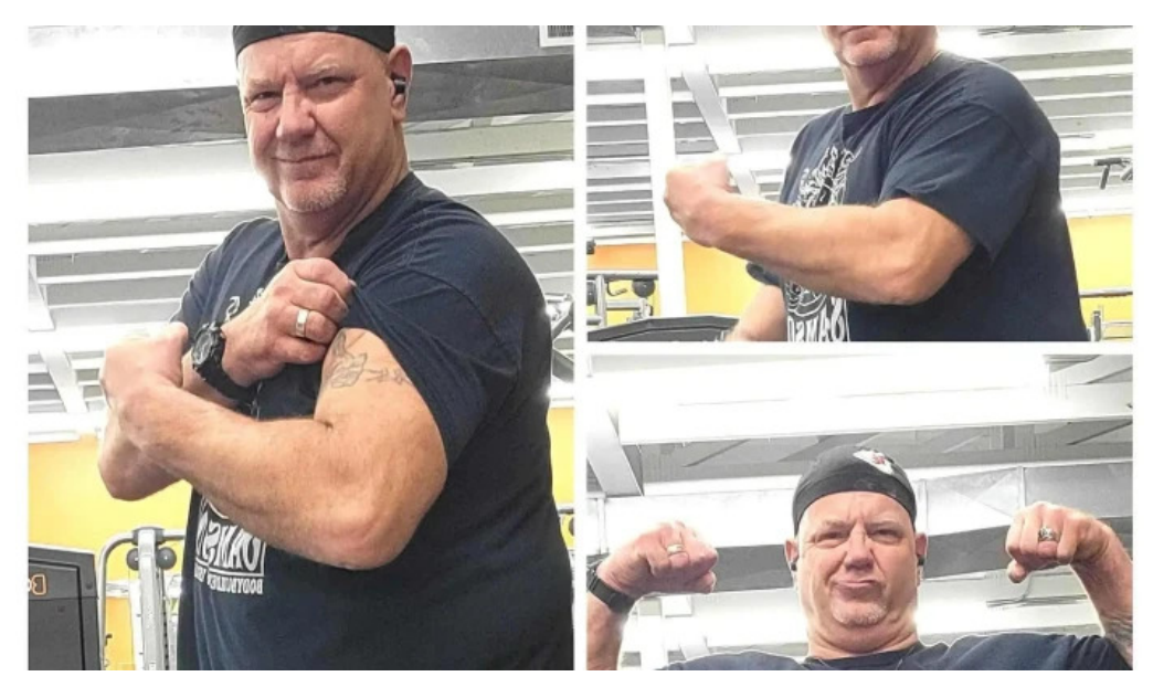
Anytime fitness newton promotion