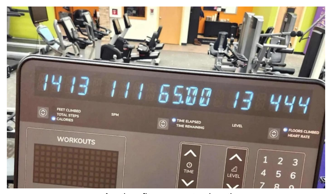
Anytime fitness newton location