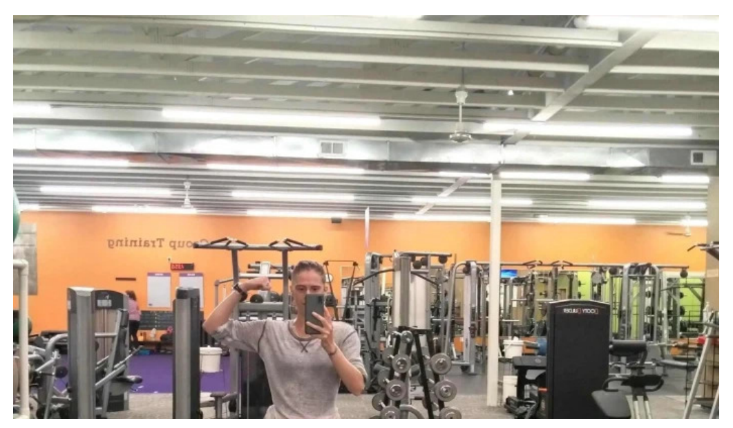
Anytime fitness newton gym