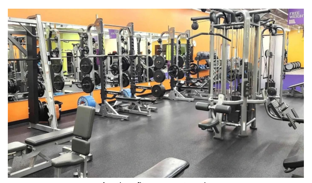
Anytime fitness newton phone