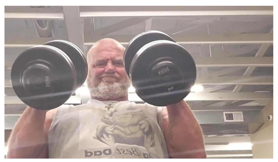
Anytime fitness newton newton