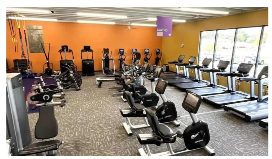
Anytime fitness newton all