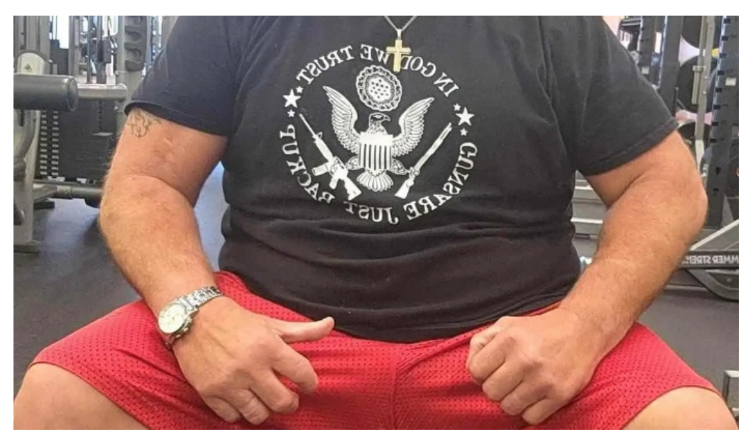
Anytime fitness newton latest