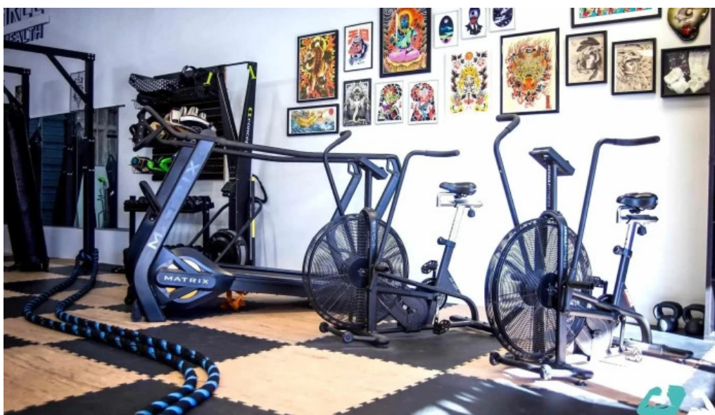
Circuit three fitness kickboxing all