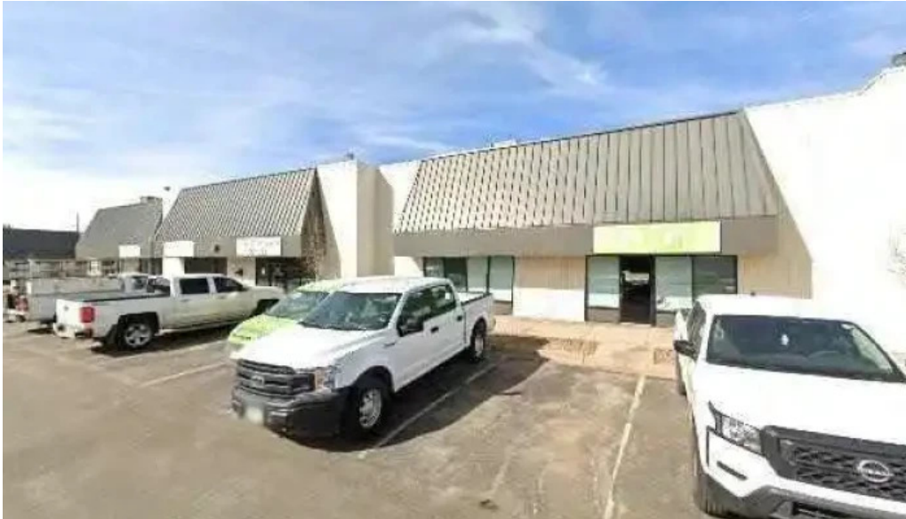
Circuit three fitness kickboxing street view 360deg