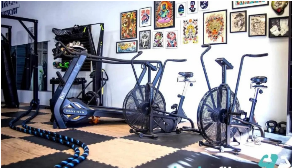
Circuit three fitness kickboxing northglenn