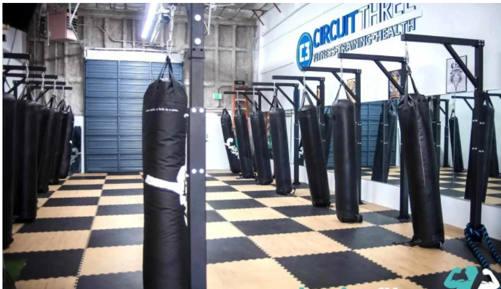
Circuit three fitness kickboxing gym