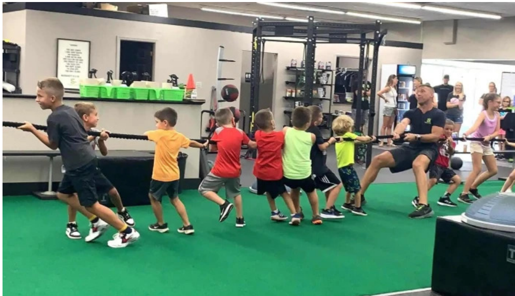
Sweat bar fitness schedule