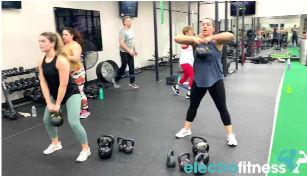
Sweat bar fitness by owner