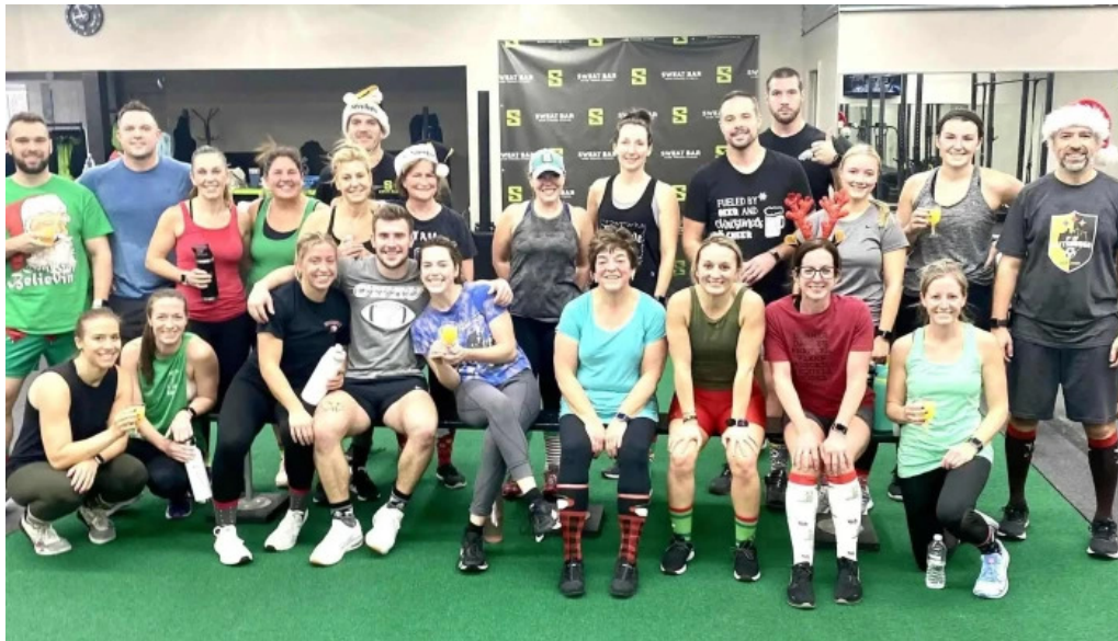
Sweat bar fitness address