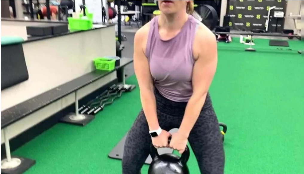
Sweat bar fitness videos