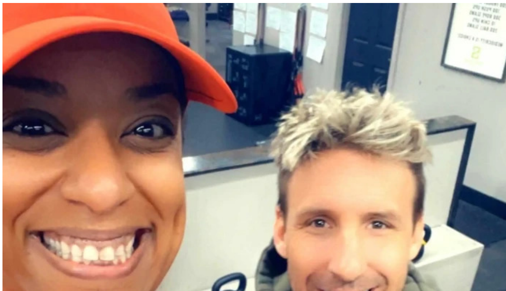
Sweat bar fitness prices