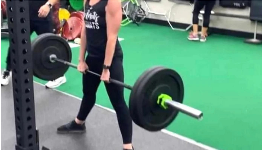
Sweat bar fitness oakdale