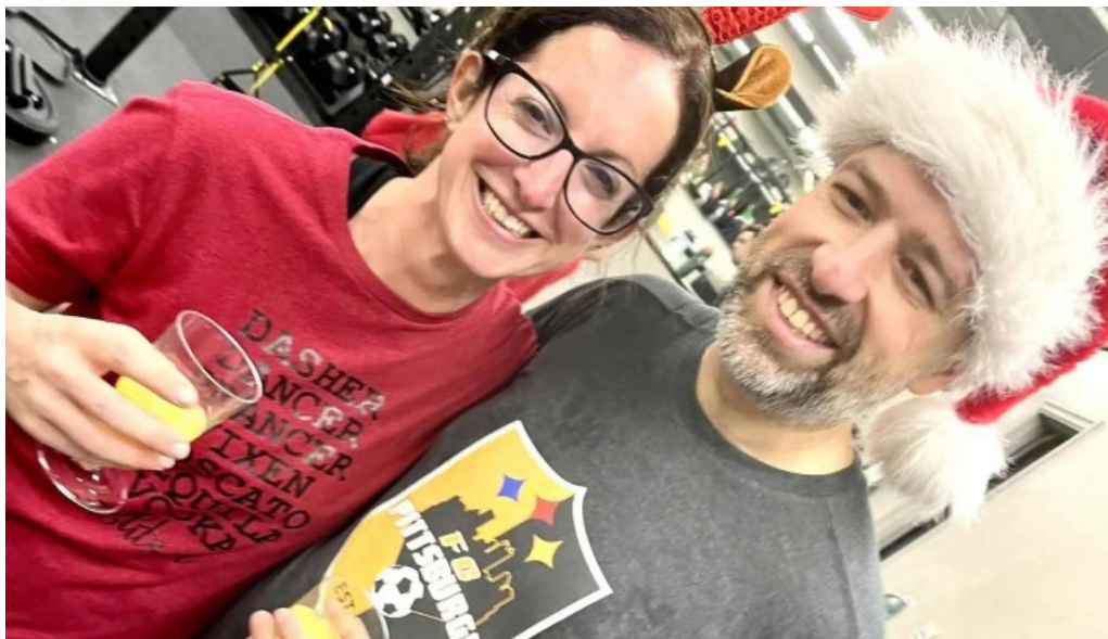
Sweat bar fitness comments