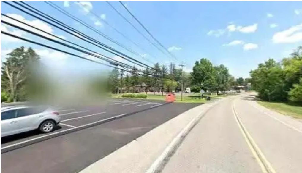
Sweat bar fitness street view 360deg