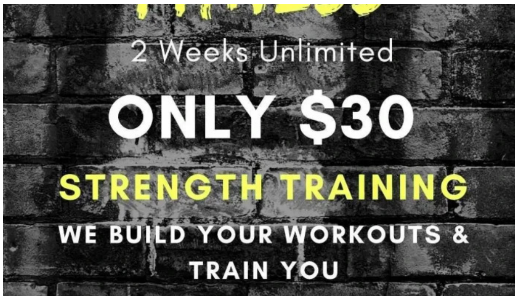
Sweat bar fitness all