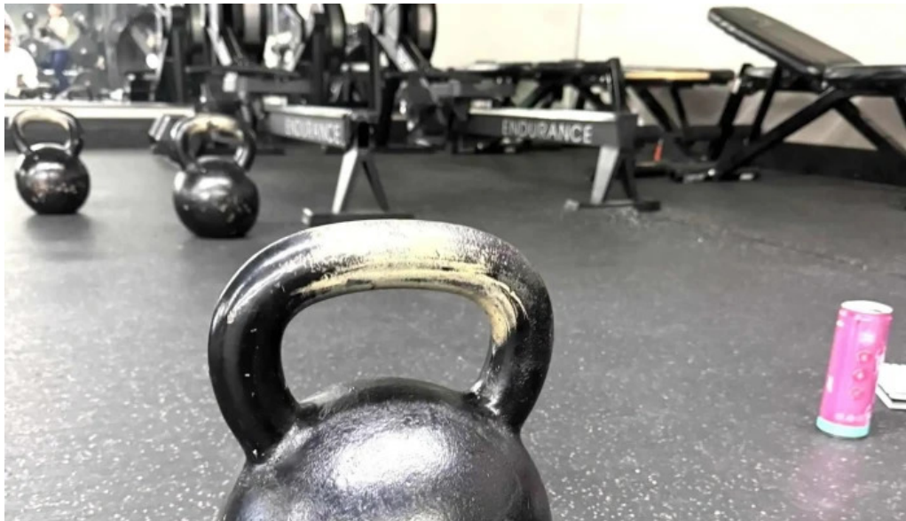
Sweat bar fitness gym