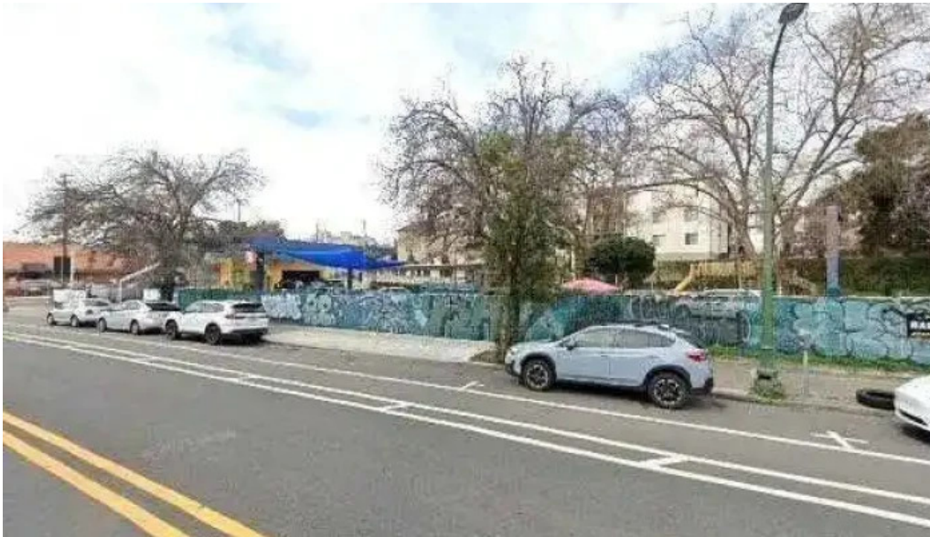
Brightside barbell street view 360deg