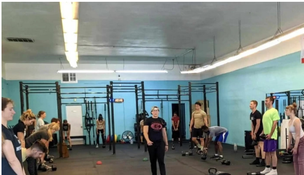
Brightside barbell gym