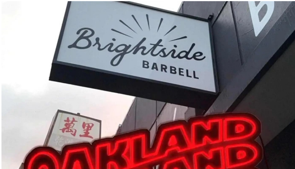
Brightside barbell address