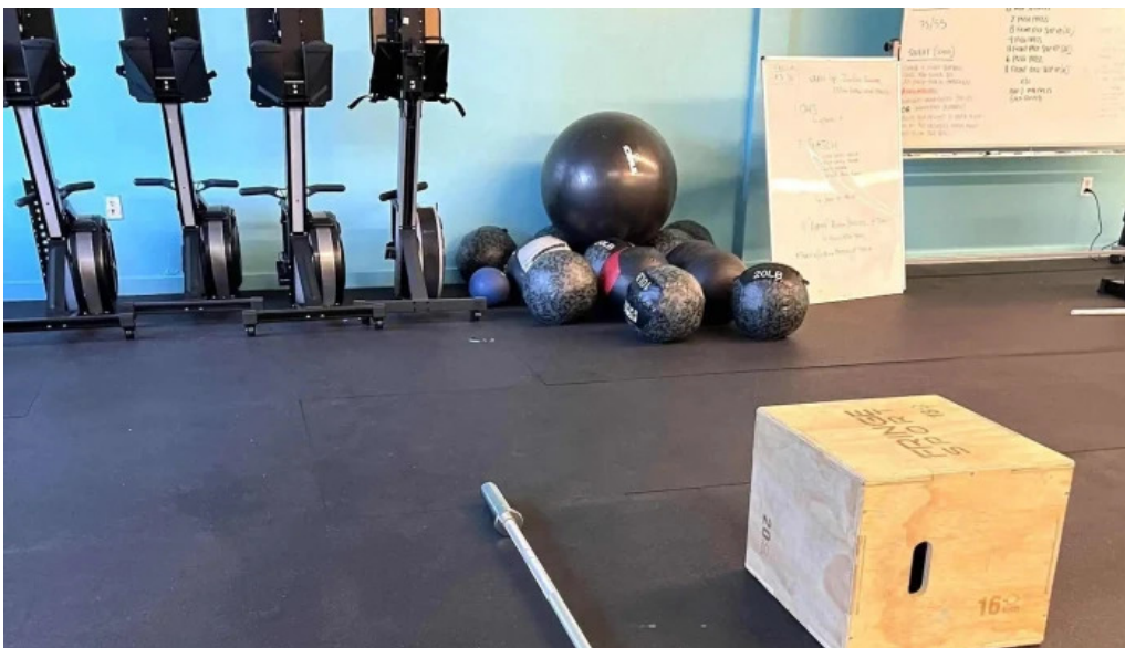
Brightside barbell oakland