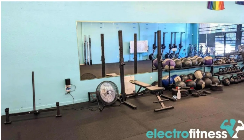
Brightside barbell all