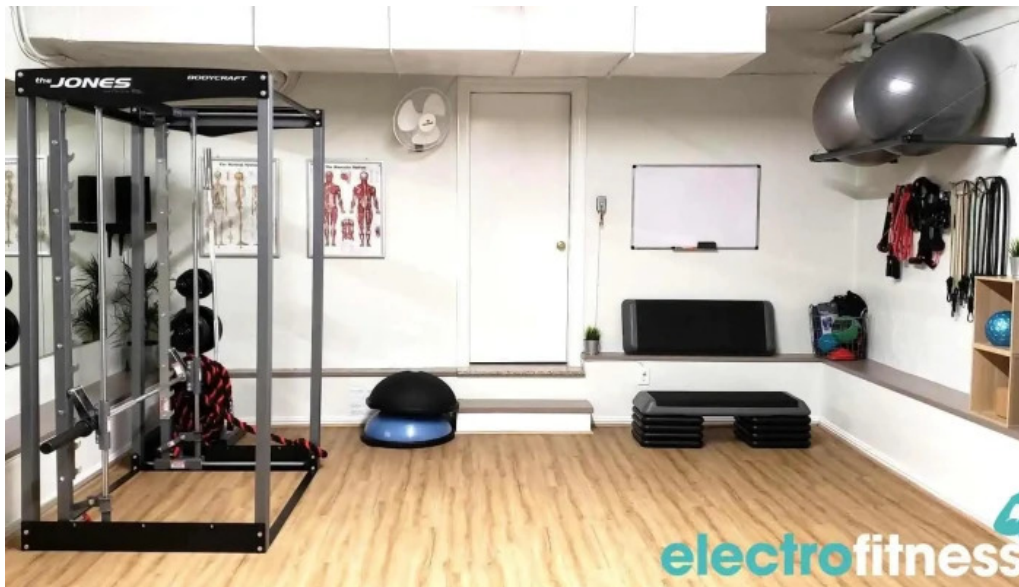
Julies garage gym all