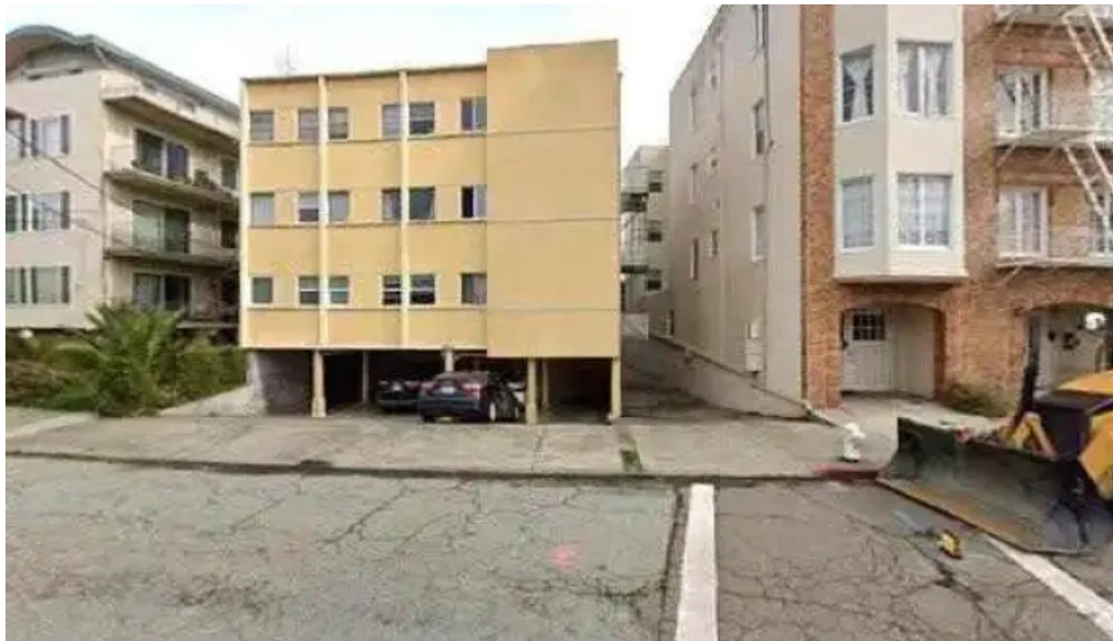
Julies garage gym street view 360deg