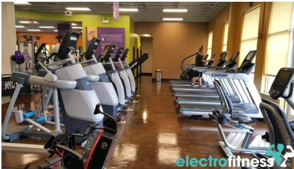
Anytime fitness exercise machine