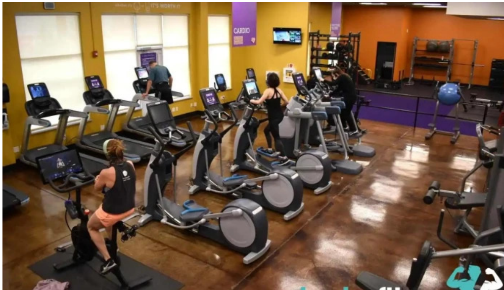
Anytime fitness oakmont