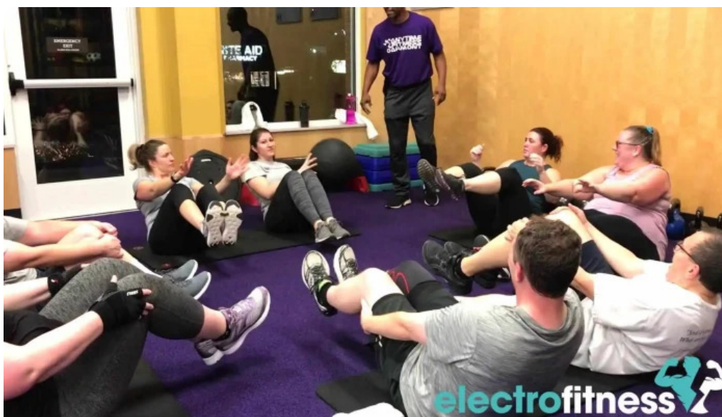
Anytime fitness by owner