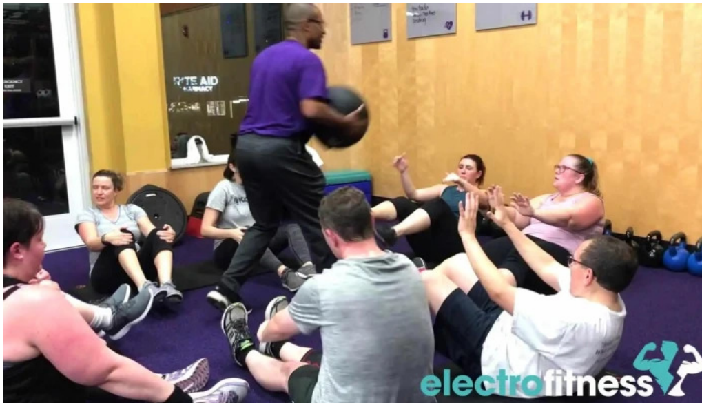
Anytime fitness videos