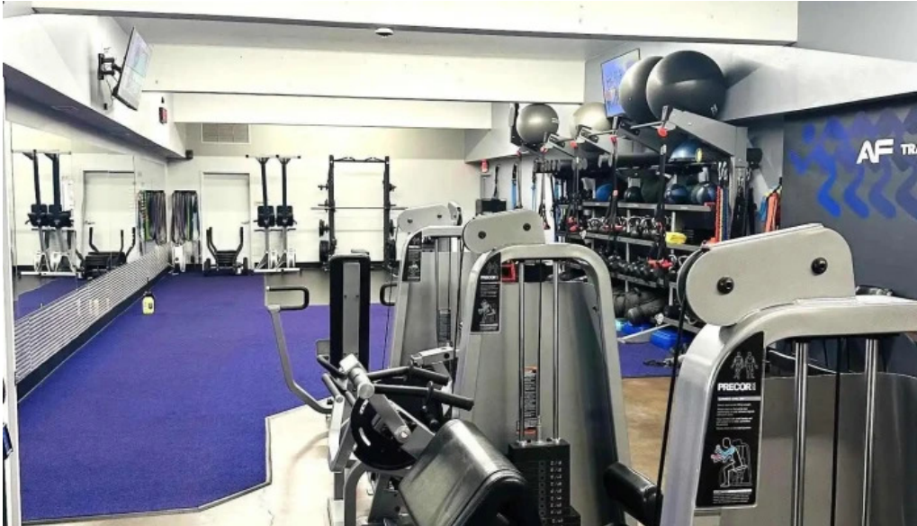
Anytime fitness by owner