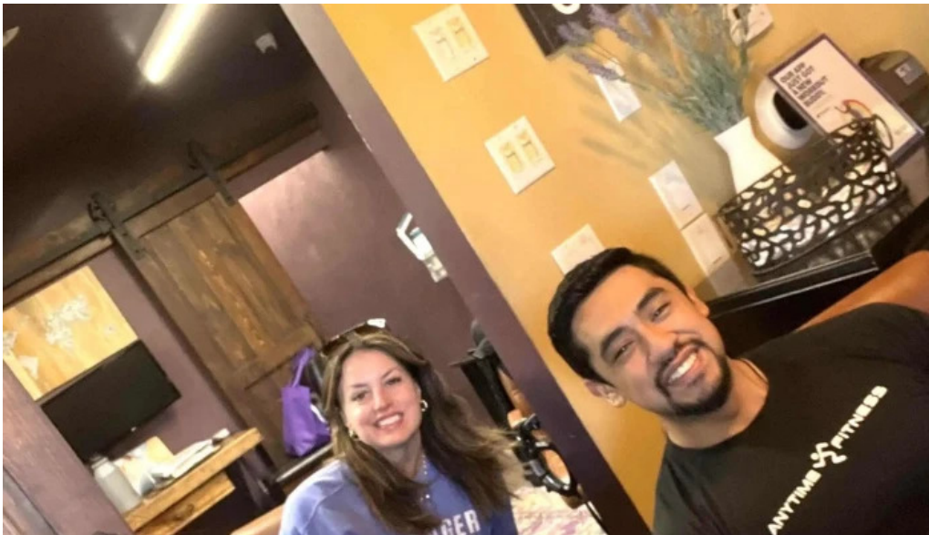
Anytime fitness area