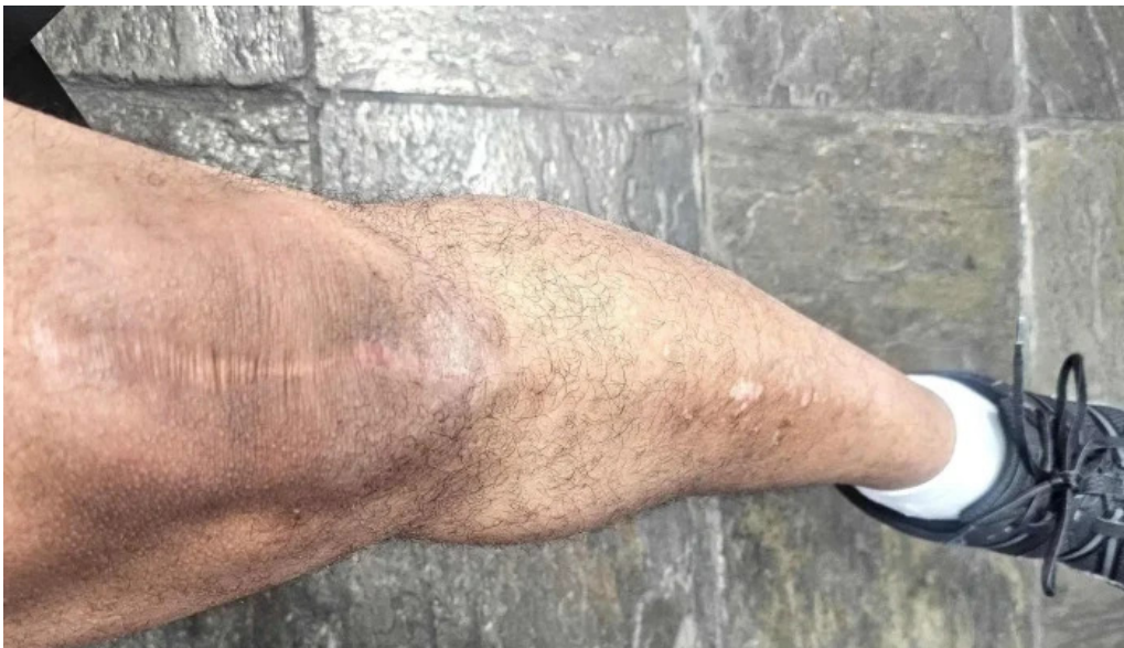
Anytime fitness othello