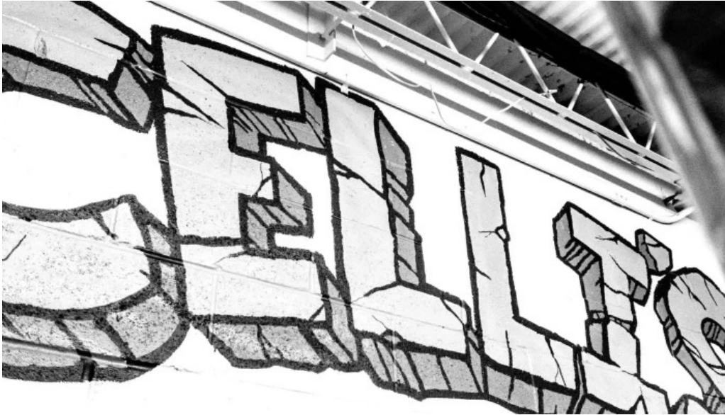
Cellis fitness center gym