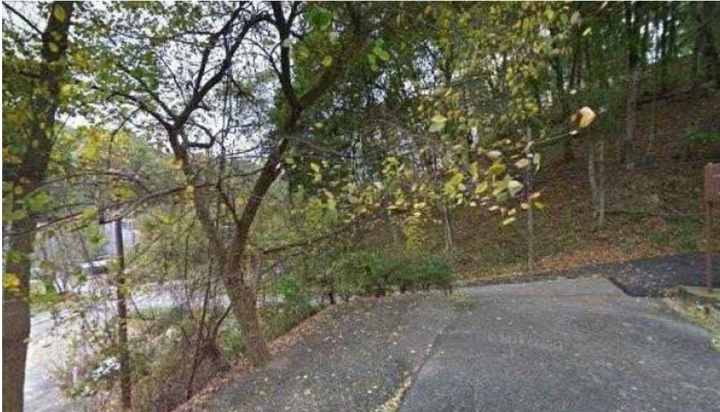
Cellis fitness center street view 360deg