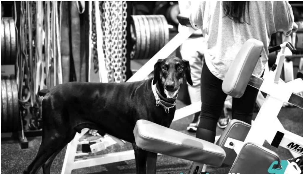
Cellis fitness center by owner