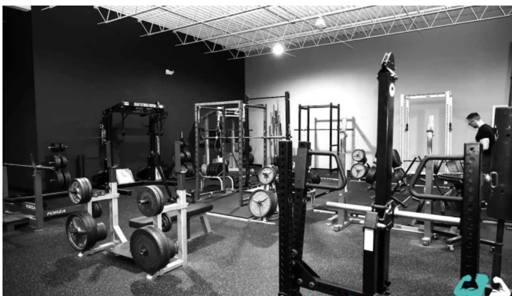
Celli s fitness center pittsburgh