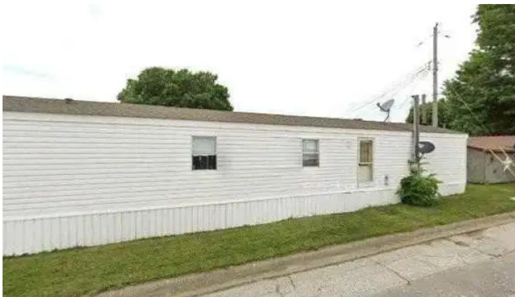
Midwest iron all