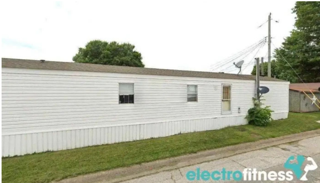
Midwest iron quincy