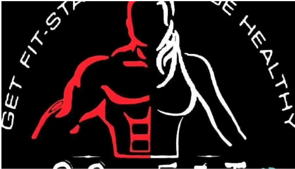
So fit club videos