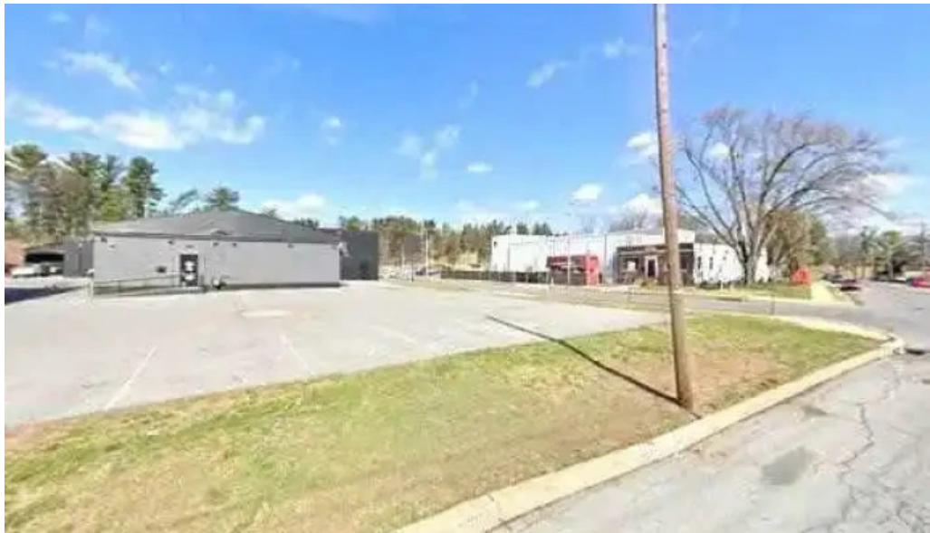
So fit club street view 360deg