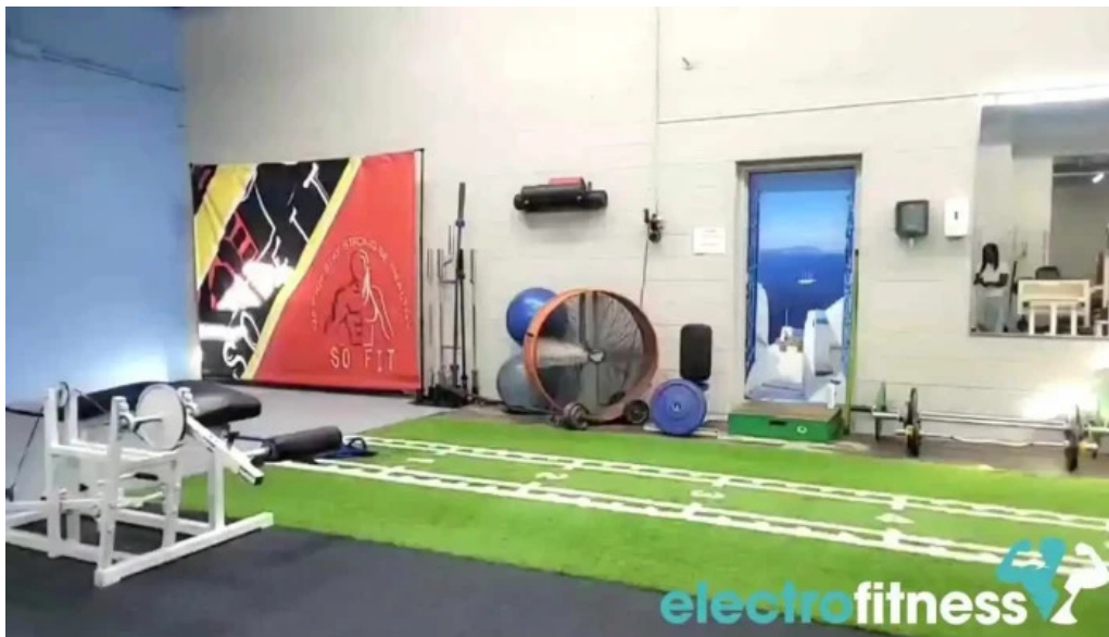
So fit club by owner