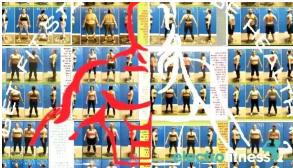
So fit club reading