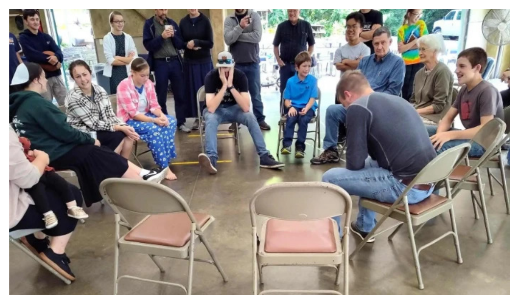
Boulder ridge retreat reviews