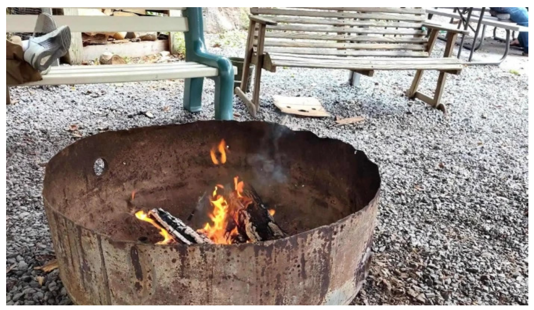
Boulder ridge retreat reinholds