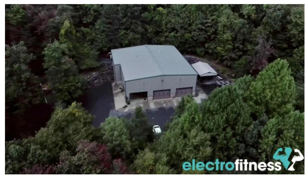
Boulder ridge retreat videos