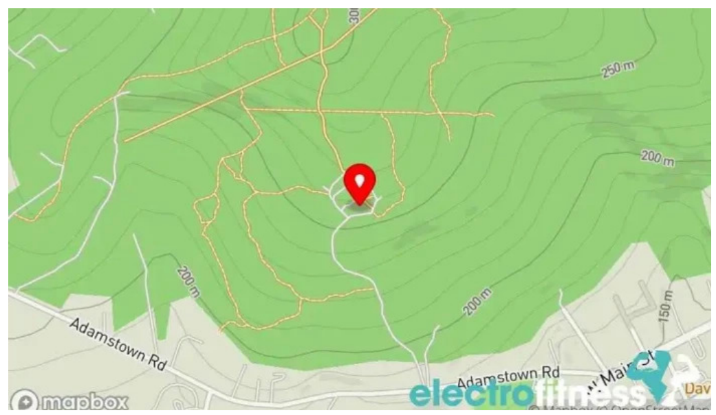
Boulder ridge retreat map