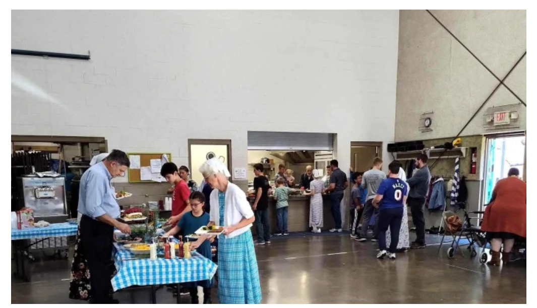
Boulder ridge retreat gym