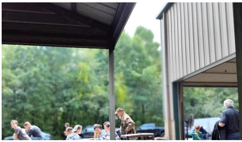
Boulder ridge retreat location