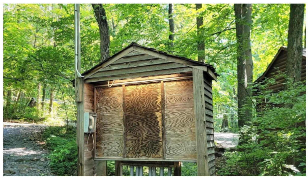
Boulder ridge retreat all