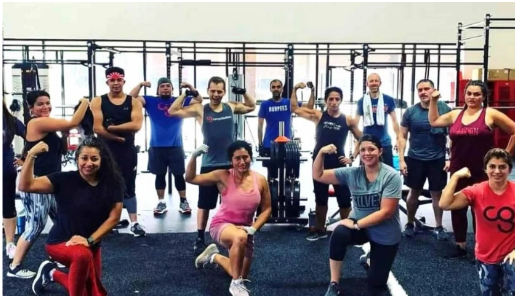
Train 4 tomorrow phone