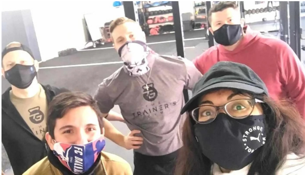
Train 4 tomorrow richardson