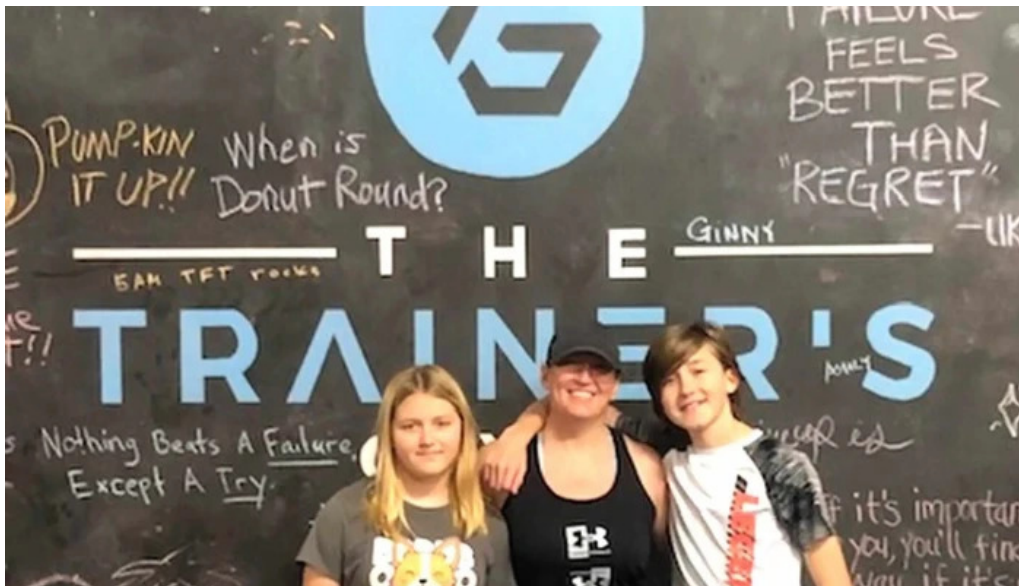
Train 4 tomorrow gym