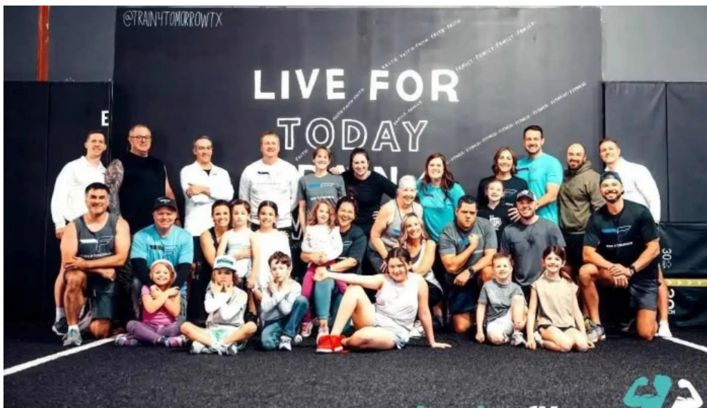
Train 4 tomorrow all