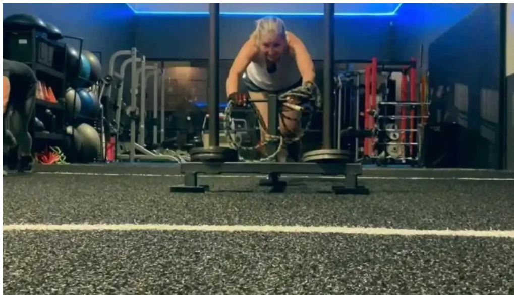
Train 4 tomorrow videos