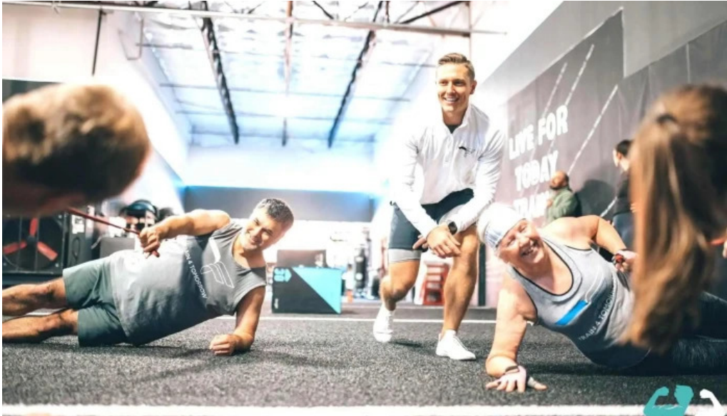
Train 4 tomorrow latest