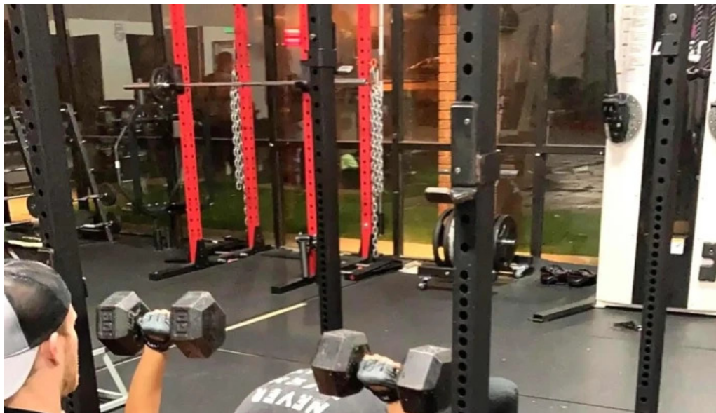
Train 4 tomorrow comments