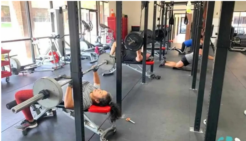
Train 4 tomorrow exercise machine