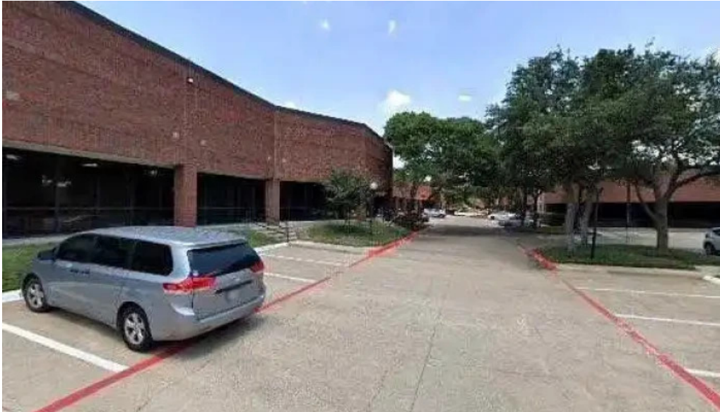
Train 4 tomorrow street view 360deg