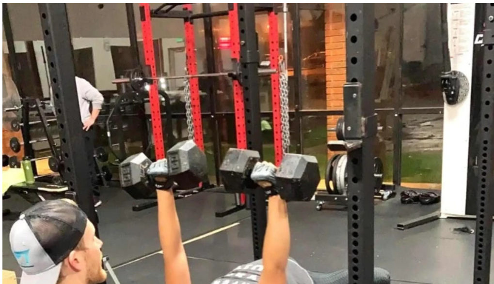
Train 4 tomorrow where