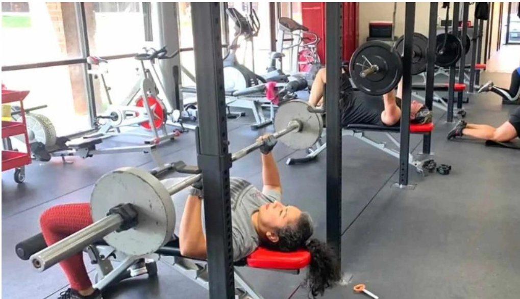
Train 4 tomorrow schedule