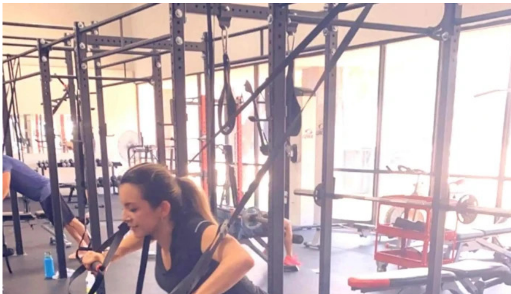
Train 4 tomorrow open now