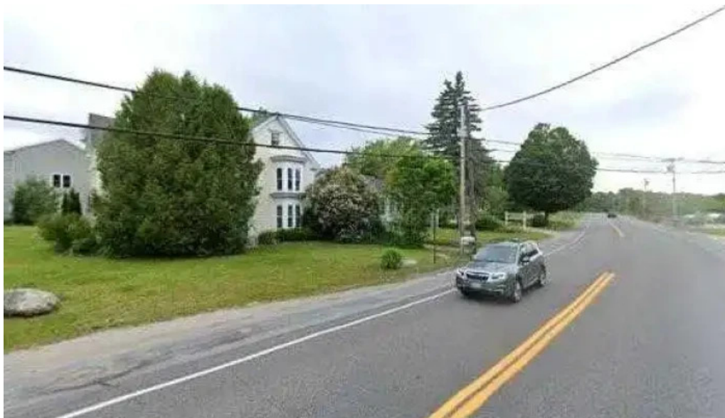
Cj strength conditioning street view 360deg