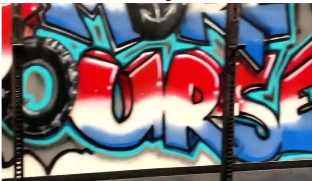
Cj strength conditioning videos