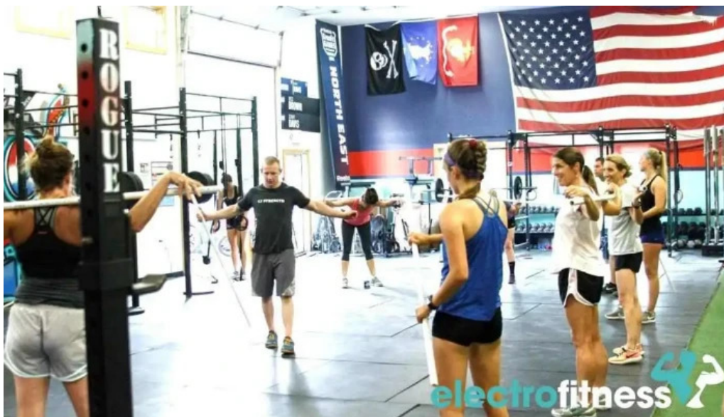
Cj strength conditioning rockport