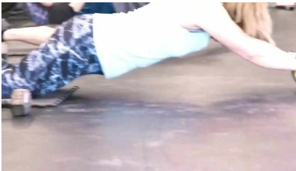
Cj strength conditioning by owner