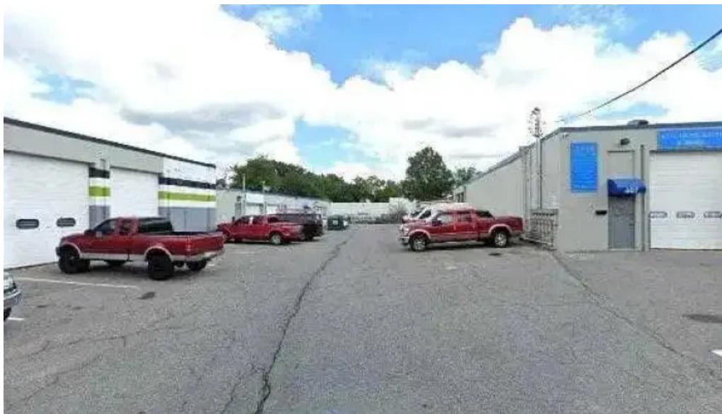
Prepare for performance street view 360deg