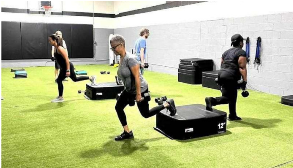
Prepare for performance rockville