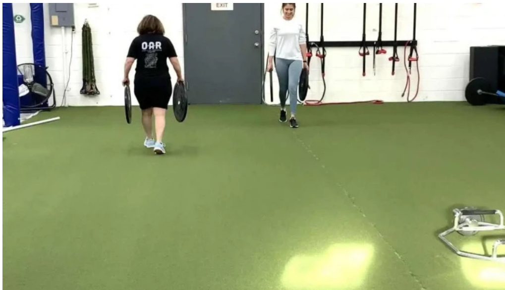
Prepare for performance by owner