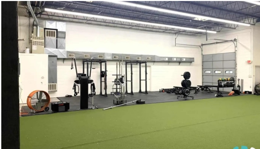
Prepare for performance gym