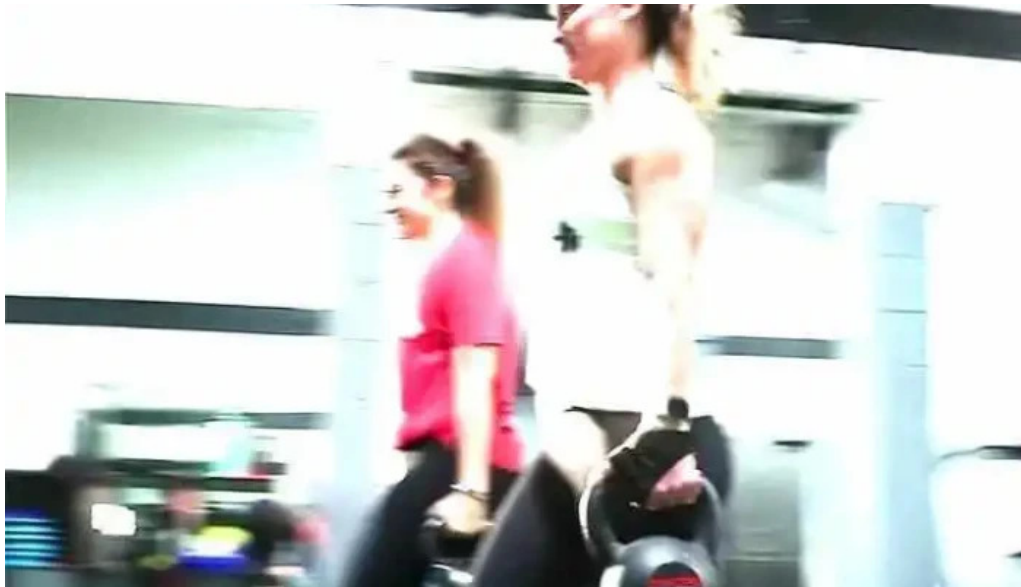
Prepare for performance videos