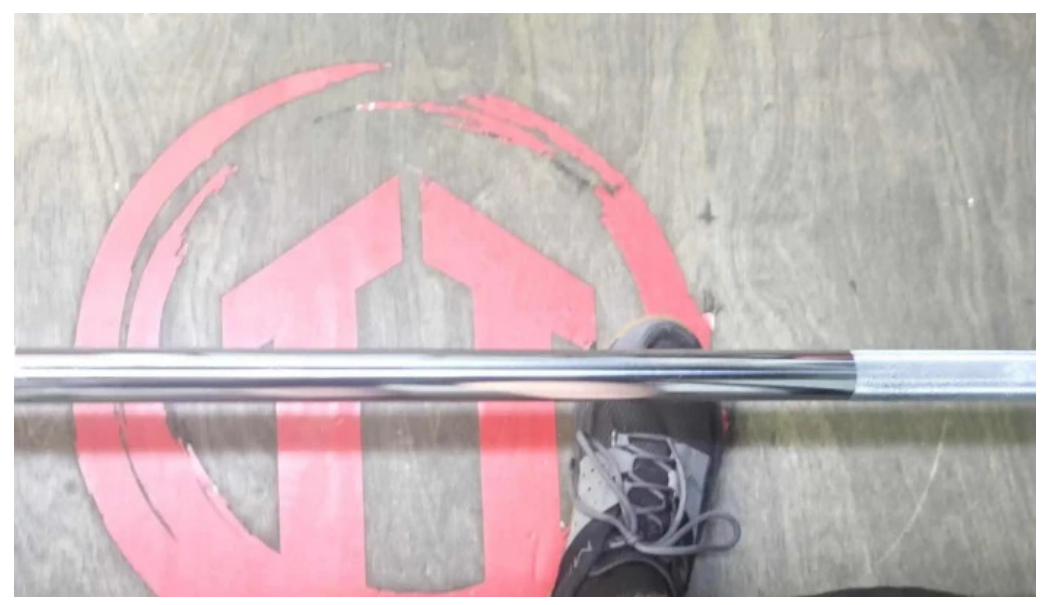
Tough temple rockville