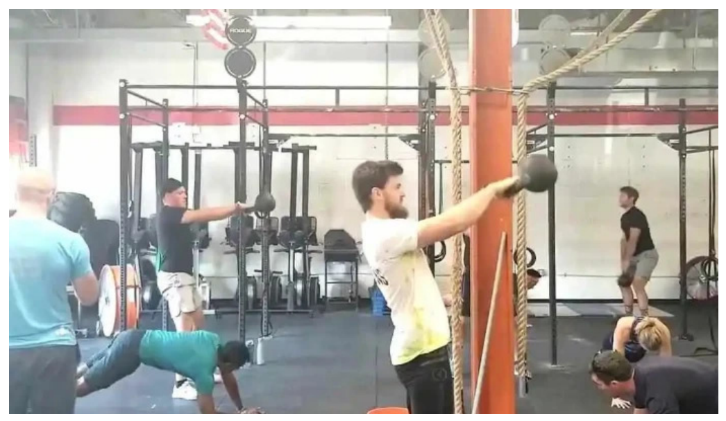
Tough temple videos