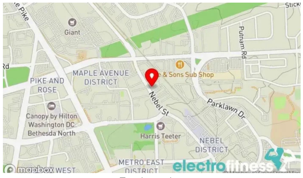
Tough temple map