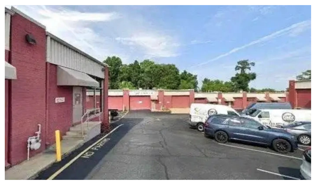
Tough temple street view 360deg