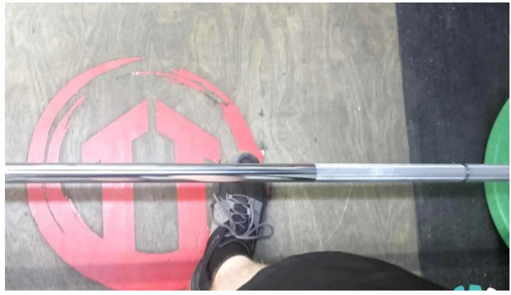
Tough temple latest