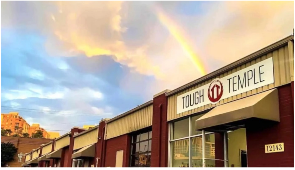
Tough temple all