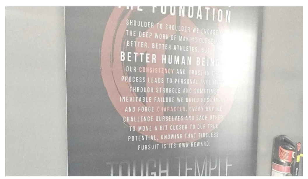
Tough temple gym