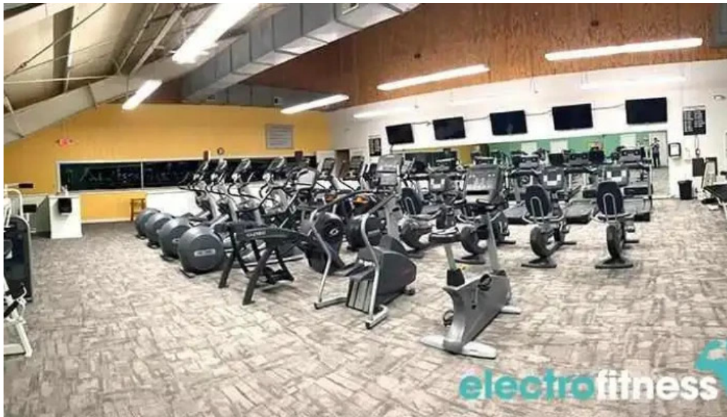
Vermont sport fitness club gym