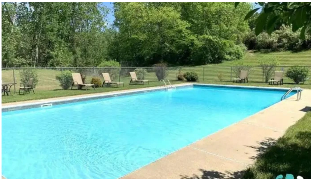
Vermont sport fitness club by owner