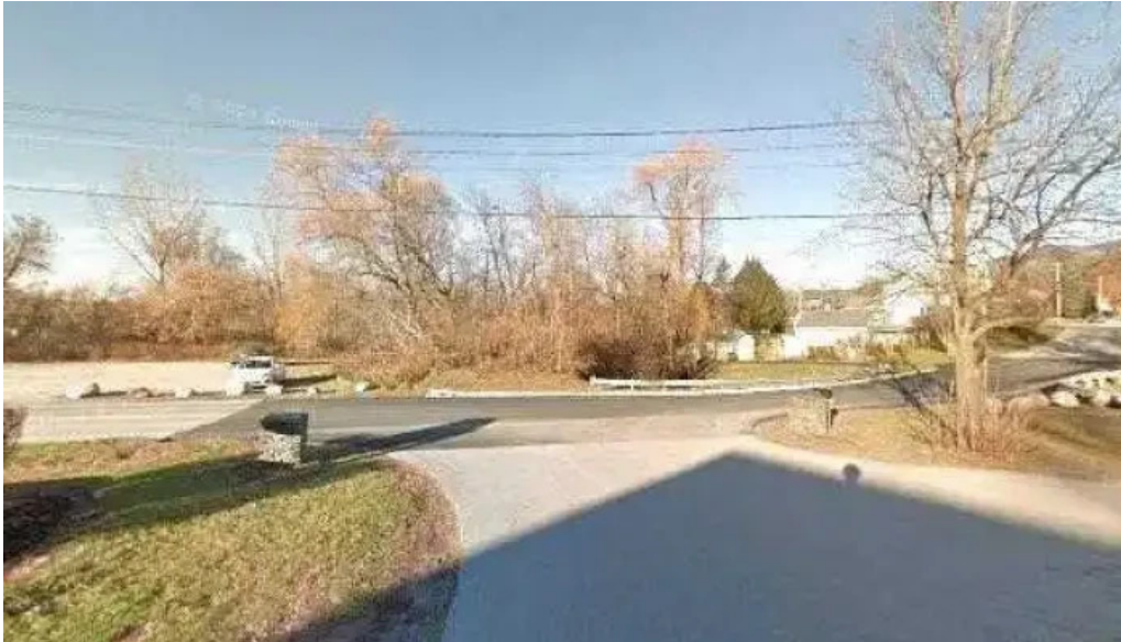
Vermont sport fitness club street view 360deg