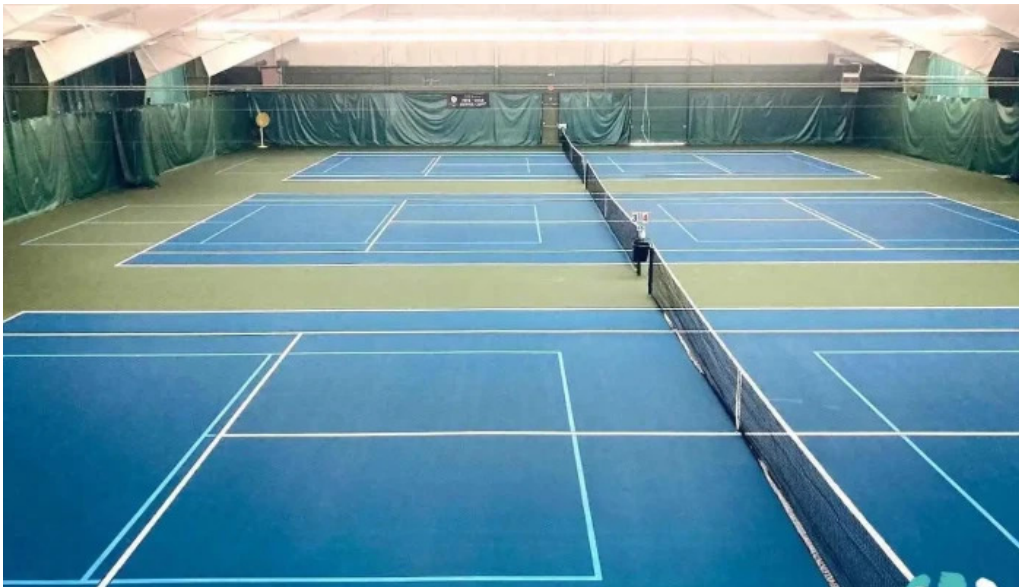
Vermont sport fitness club rutland