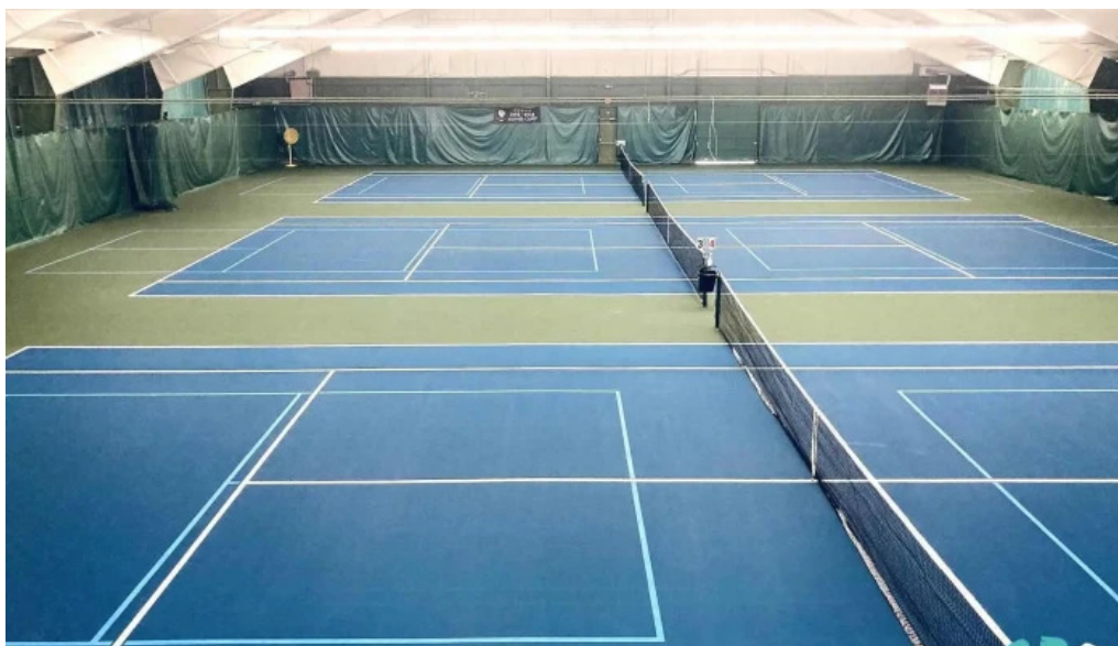
Vermont sport fitness club all