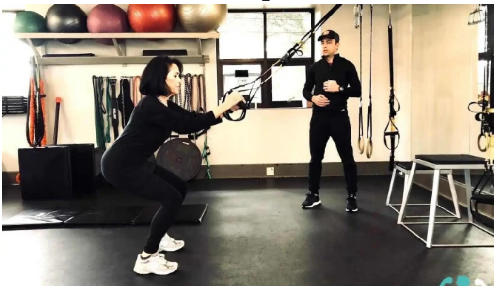
Mbs fitness training pilates yoga san antonio