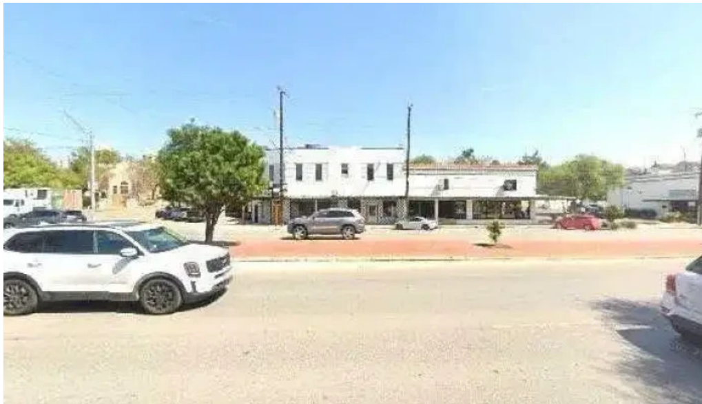
Mbs fitness training pilates yoga street view 360deg