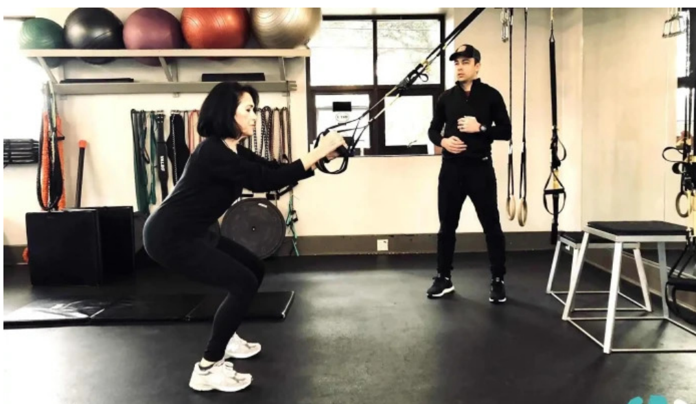
Mbs fitness training pilates yoga all