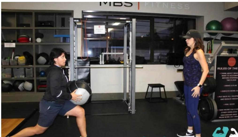
Mbs fitness training pilates yoga gym