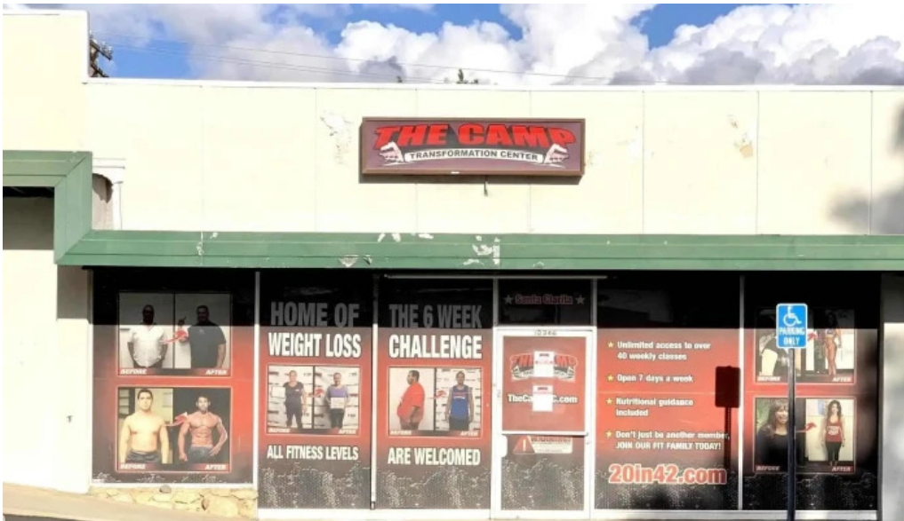
The camp transformation center number