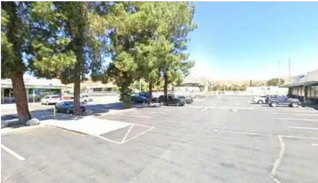
The camp transformation center street view 360deg