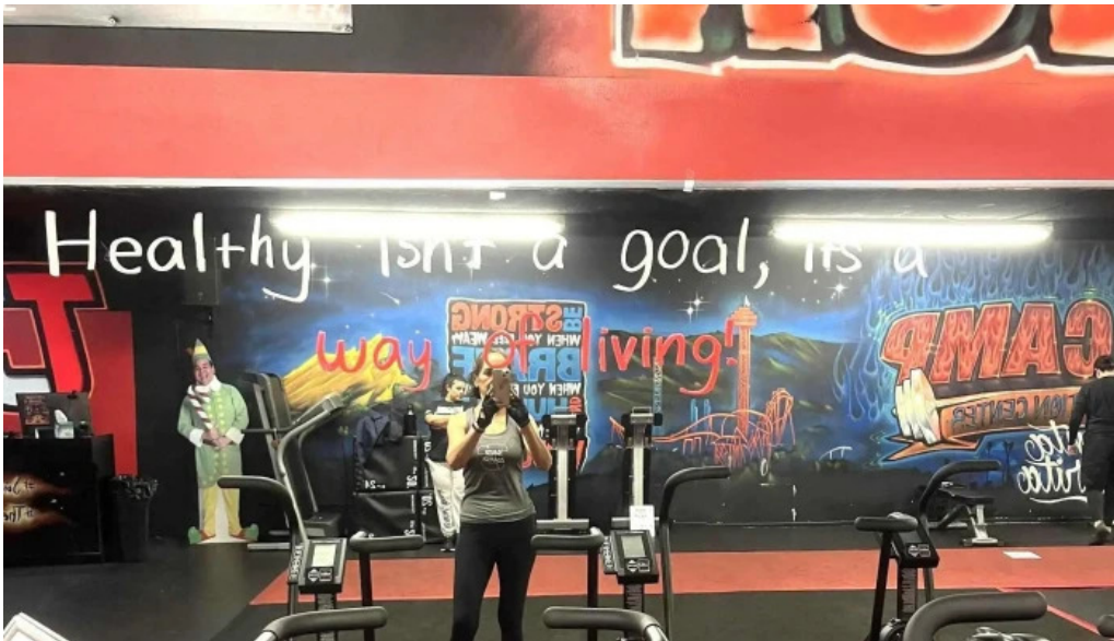
The camp transformation center prices