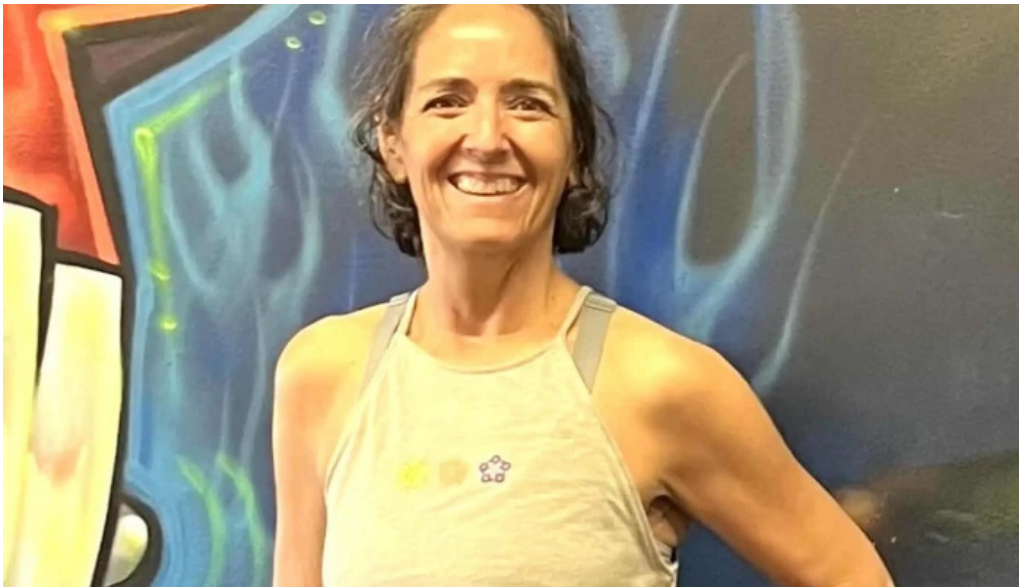
The camp transformation center santa clarita