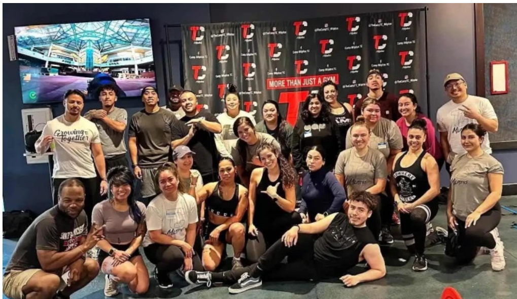
The camp transformation center latest