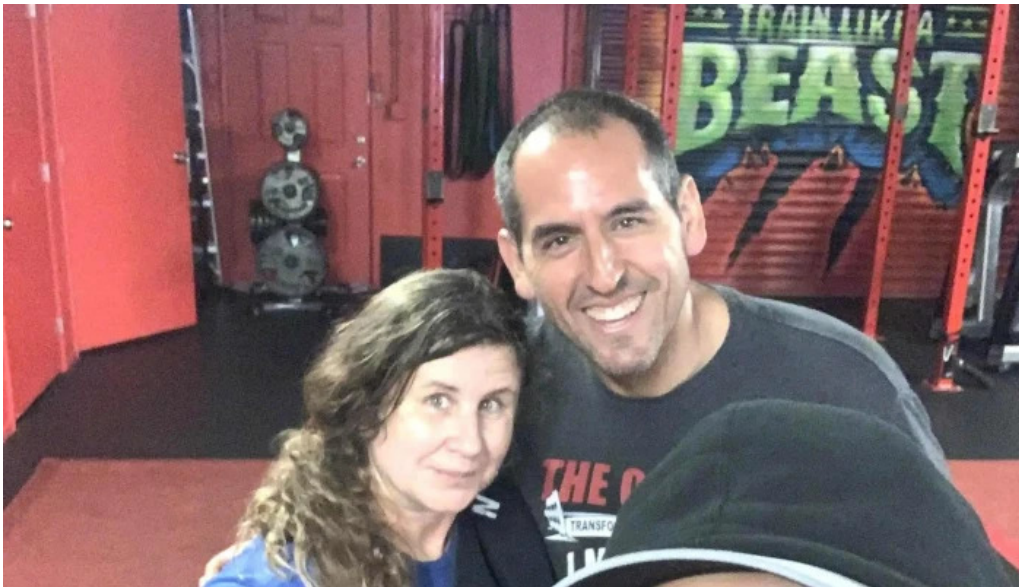
The camp transformation center videos