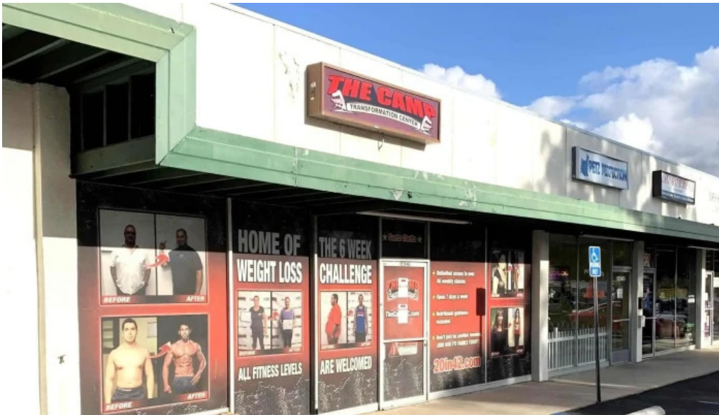
The camp transformation center instagram