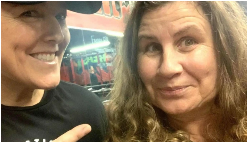
The camp transformation center near me