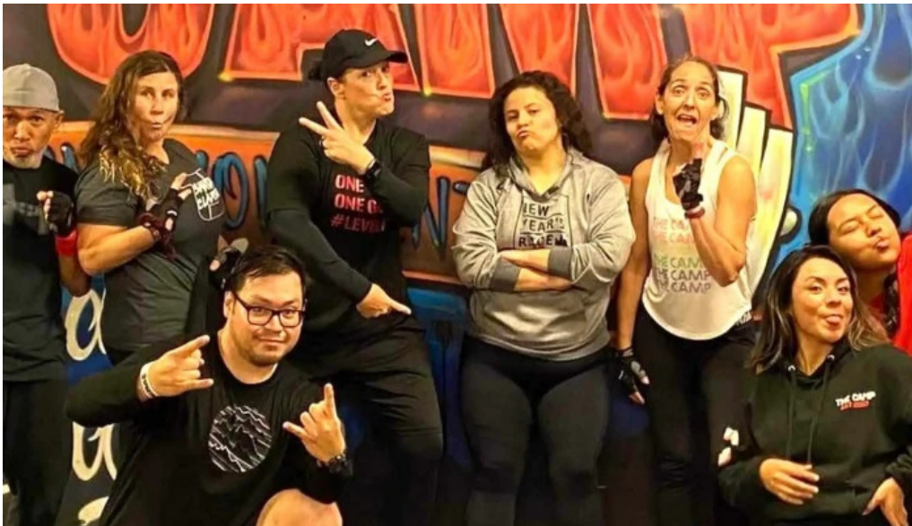
The camp transformation center gym