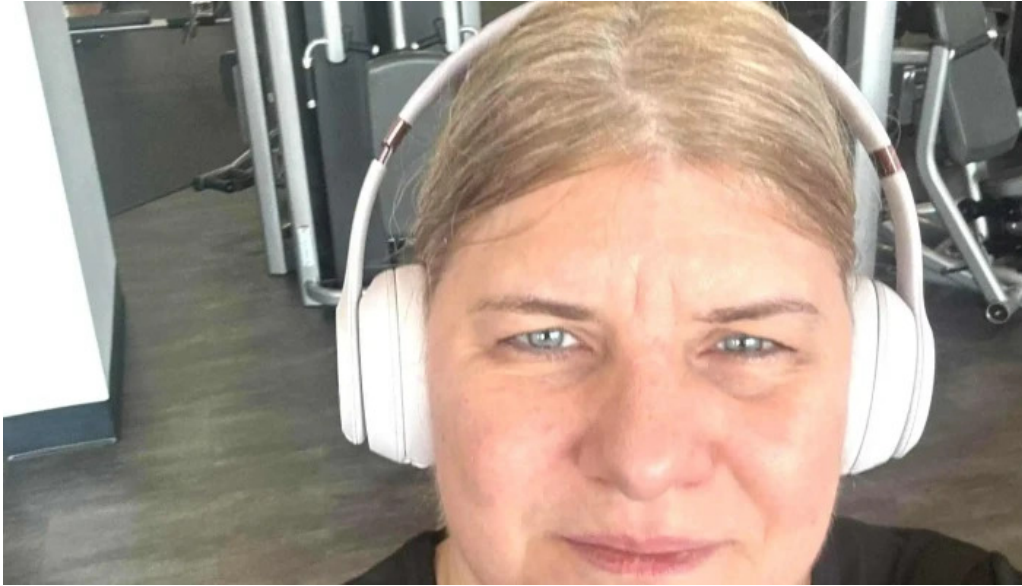
Anytime fitness gym