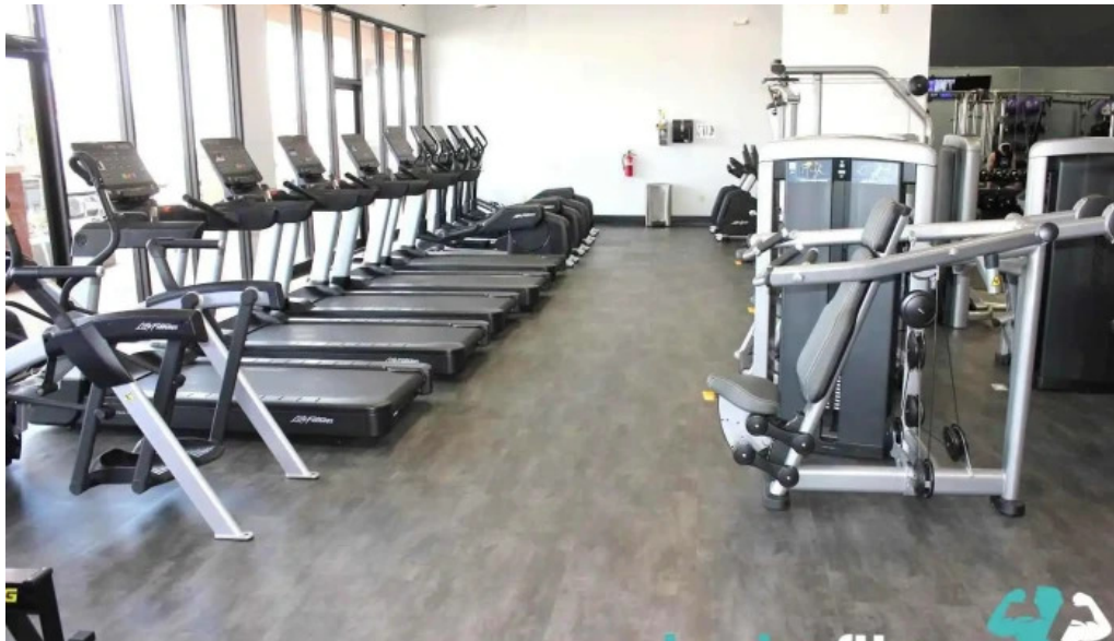
Anytime fitness server