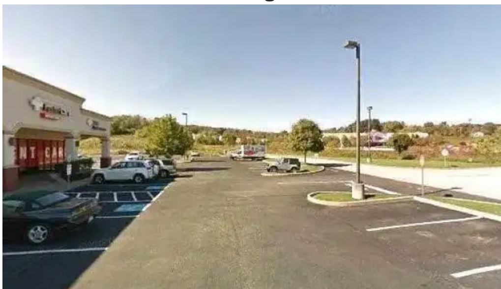
Anytime fitness street view 360deg