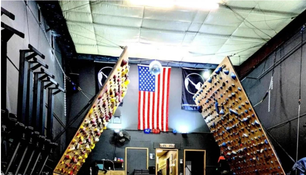
Mountain strong thornton gym thornton