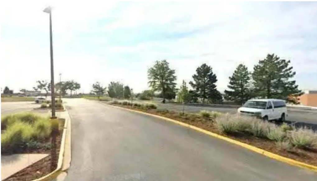
Mountain strong thornton gym street view 360deg