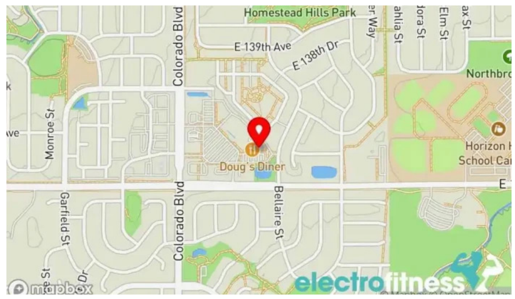
Orangetheory fitness map