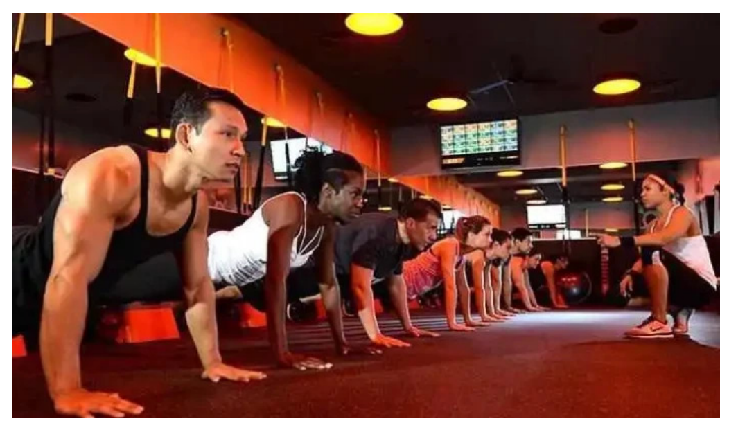
Orangetheory fitness gym