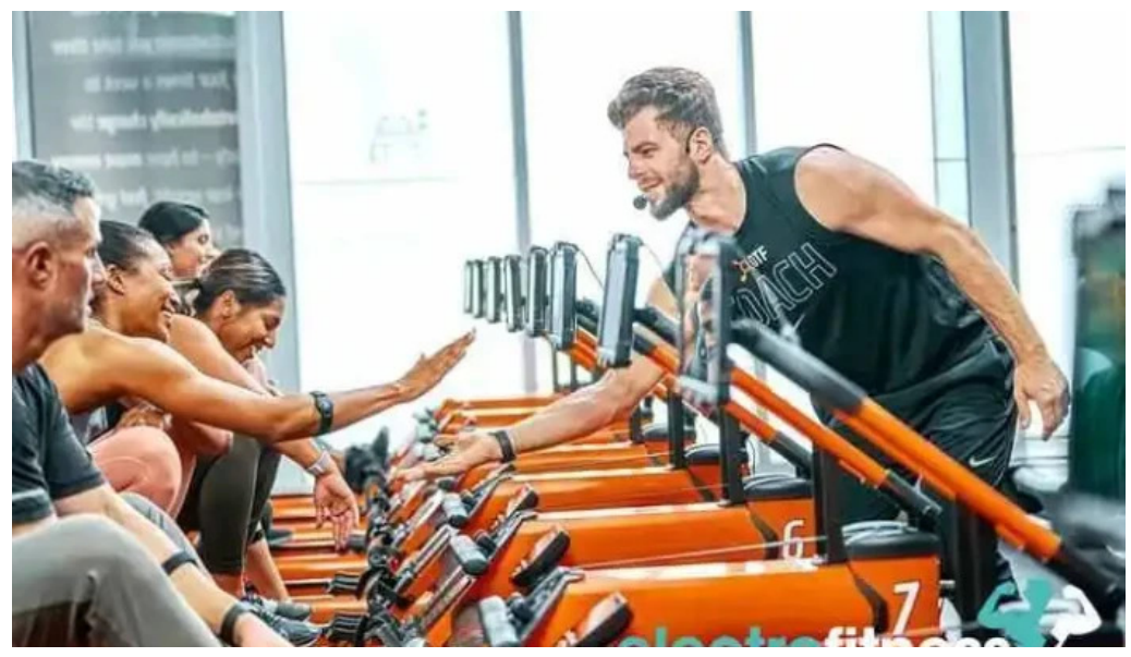
Orangetheory fitness exercise machine