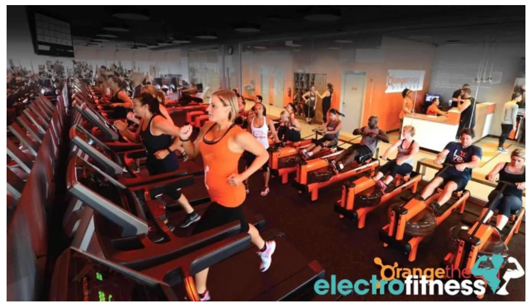
Orangetheory fitness thornton