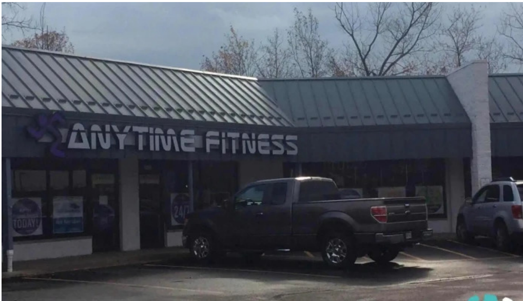
Anytime fitness by owner