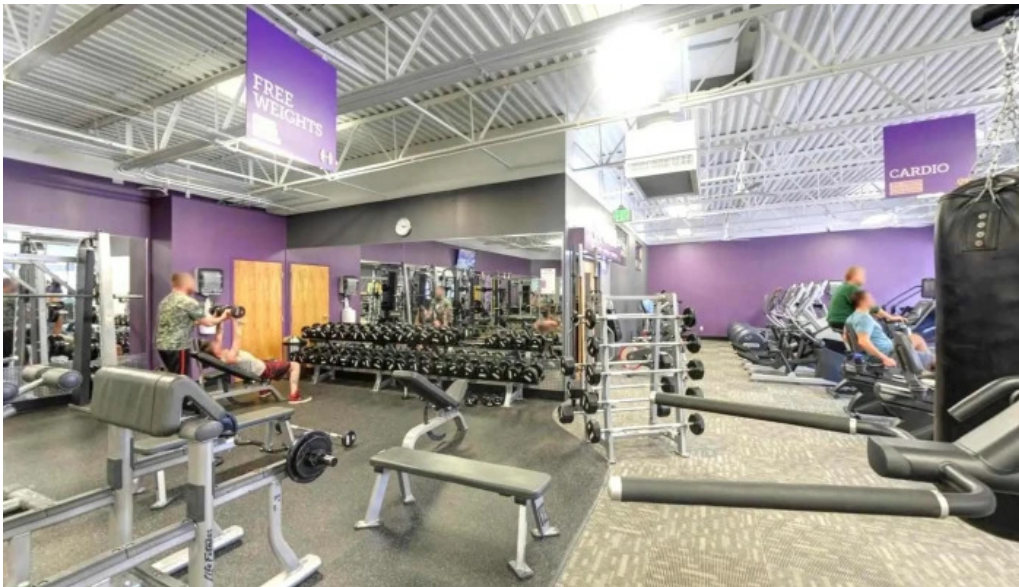
Anytime fitness street view 360