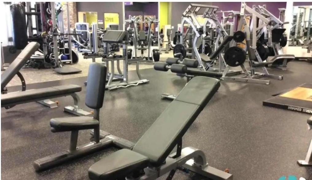
Anytime fitness valparaiso