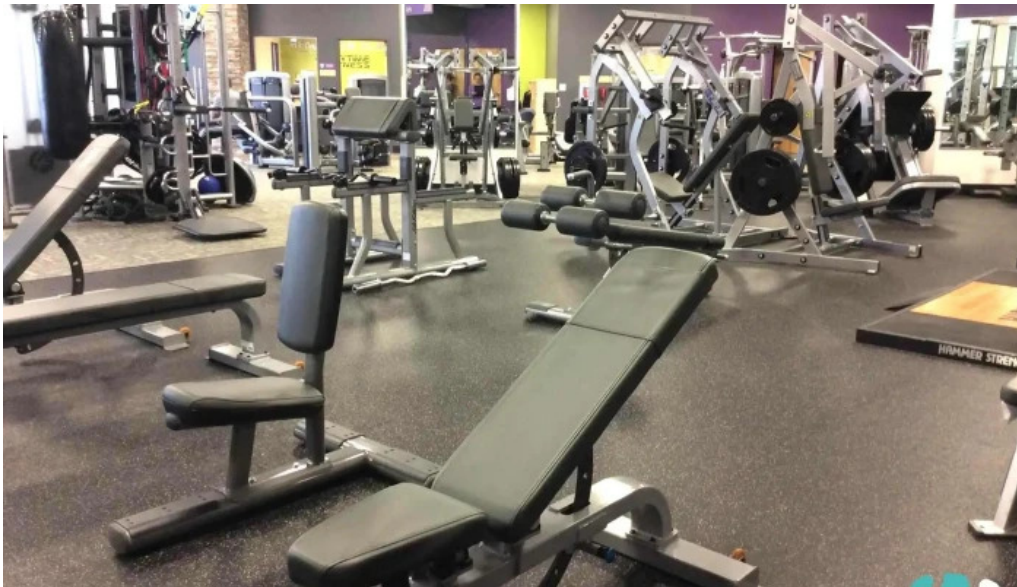
Anytime fitness all