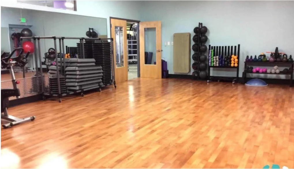
Anytime fitness gym