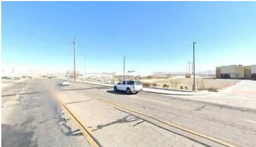
Alpha omega fitness street view 360deg