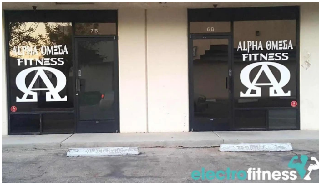
Alpha omega fitness victorville