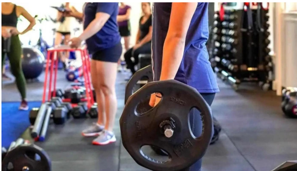
F45 training u street gym