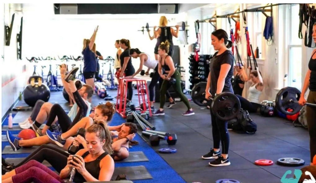
F45 training u street all