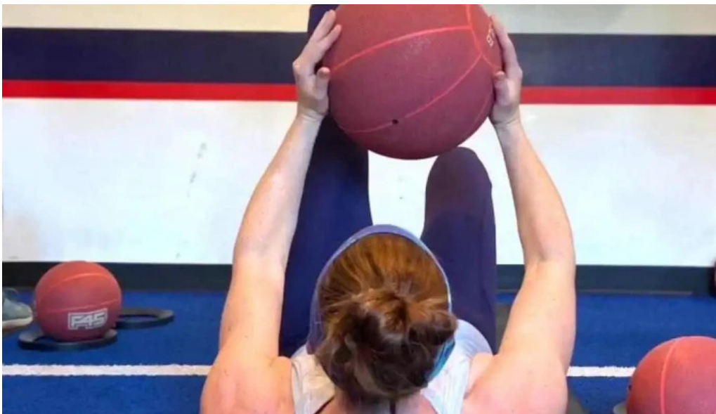
F45 training u street videos