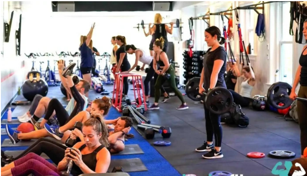
F45 training u street washington