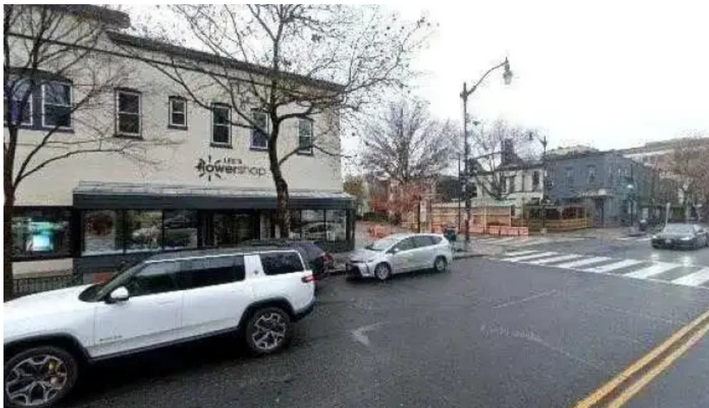
F45 training u street street view 360deg