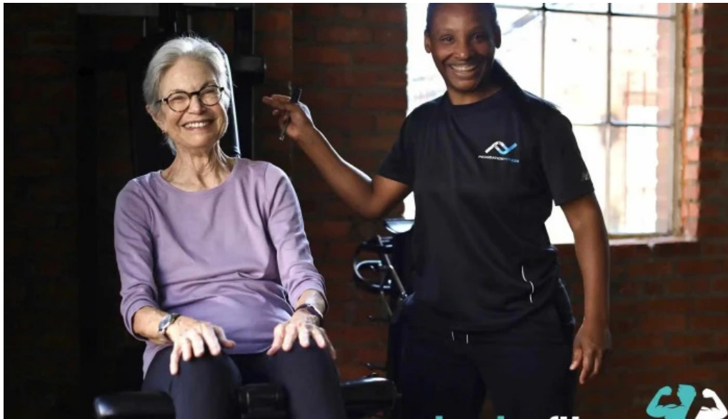
Foundation fitness of cleveland park all