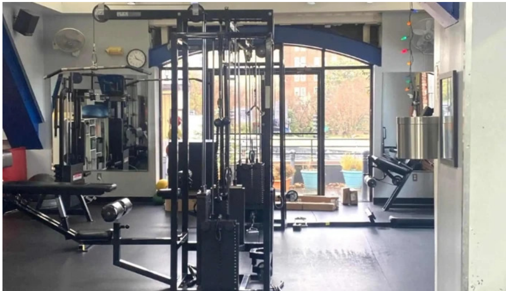
Foundation fitness of cleveland park gym