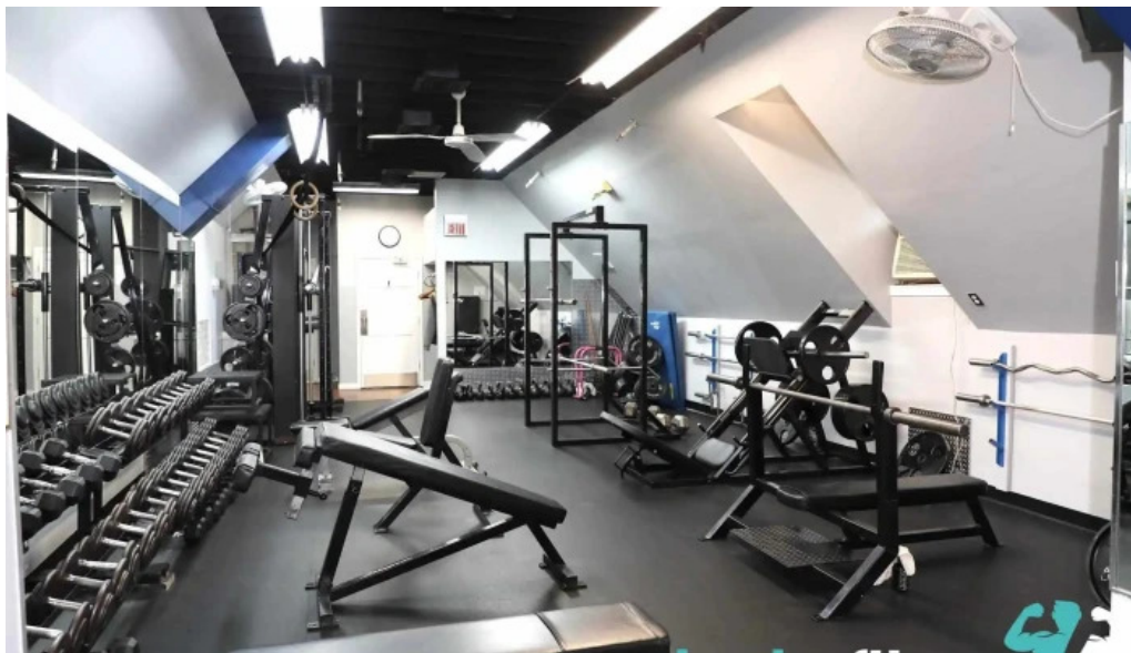
Foundation fitness of cleveland park by owner