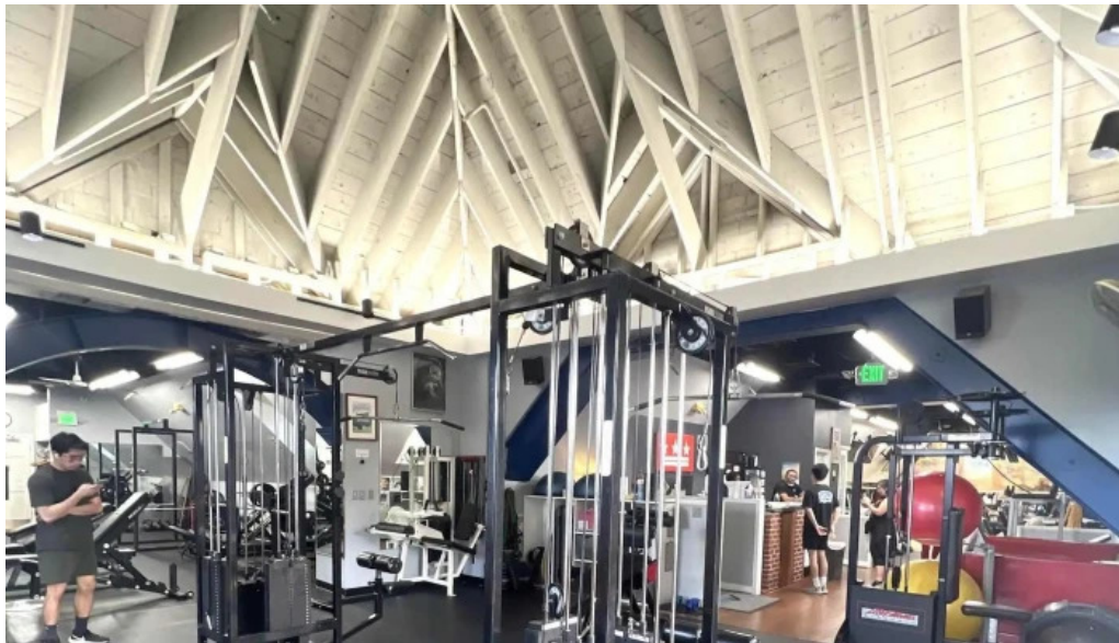
Foundation fitness of cleveland park washington