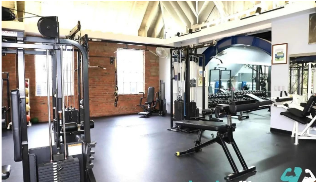
Foundation fitness of cleveland park exercise machine